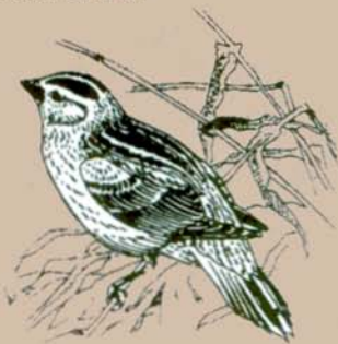
Female Bobolink Bob Hines

a abundant - occurring in large numbers c common - certain to be seen in suitable habitat u uncommon - present, but not certain to be seen o occasional - seen only a few times during the season r rare - seen at intervals of 2 - 5 years h hypothetical - within normal range, but never documented x outside normal range, but has been documented