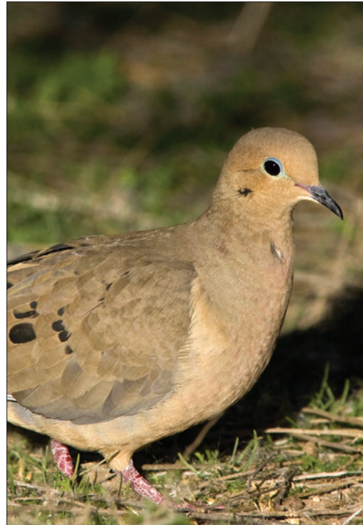
mourning dove by Bruce Taubert