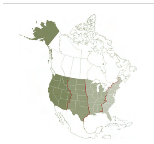
Figure 2. Map of North American flyway boundaries in the United States. Proposals working with the 16 species identified in Table 1 will be accepted from throughout North America.

In addition to guiding project selection within the Webless Migratory Game Bird Program, the Strategies are being used to illustrate and document the critical thinking and resulting priorities for improving the management of Migratory Shore and Upland Game Bird species to state partners, the Department of the Interior, the Office of Management and Budget, and Congress. The Strategies include those priorities that will significantly improve the management of Migratory Shore and Upland Game Birds and thus, represent a significant winnowing of potential research and management needs from more than three thousand, identified in earlier planning efforts, to 26. In a time of increased budget scrutiny and justification, these Strategies represent a significant accomplishment by focusing our efforts on the most important actions.