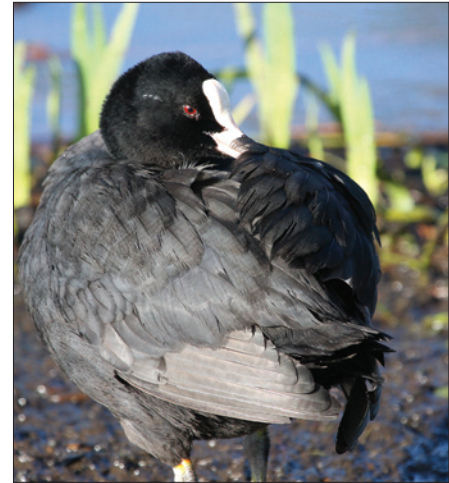
American coot