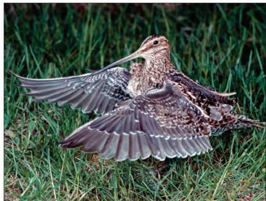
Wilson's snipe by Ron Austing

The priorities identified in the Strategies will guide project selection through the U.S. Fish and Wildlife Service's Webless Migratory Game Bird Program. The Webless Migratory Game Bird Program was designed to provide cooperative funding for both research and management activities that benefit the 16 species of webless migratory game birds in North America. (Webless migratory game birds and migratory shore and upland game birds are interchangeable terms as they refer to the same 16 species of birds listed in Table 1.) The Webless Migratory Game Bird Program has proved to