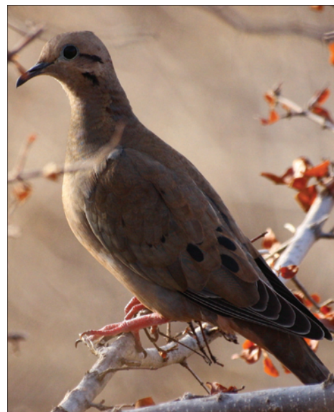
Zenaida dove