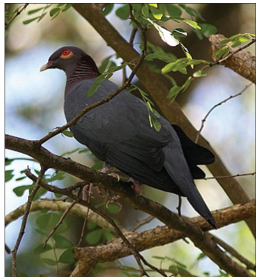
scaly-naped pigeon by Ross Tsai