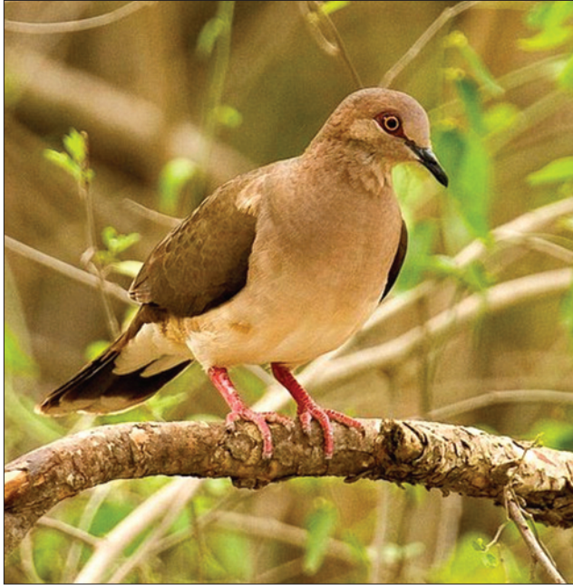
white-tipped dove

in-person and online meetings, followed by additional work via email, online meetings, and conference calls. The first Strategy was completed in June 2008 and the final Strategy was completed in February 2011.