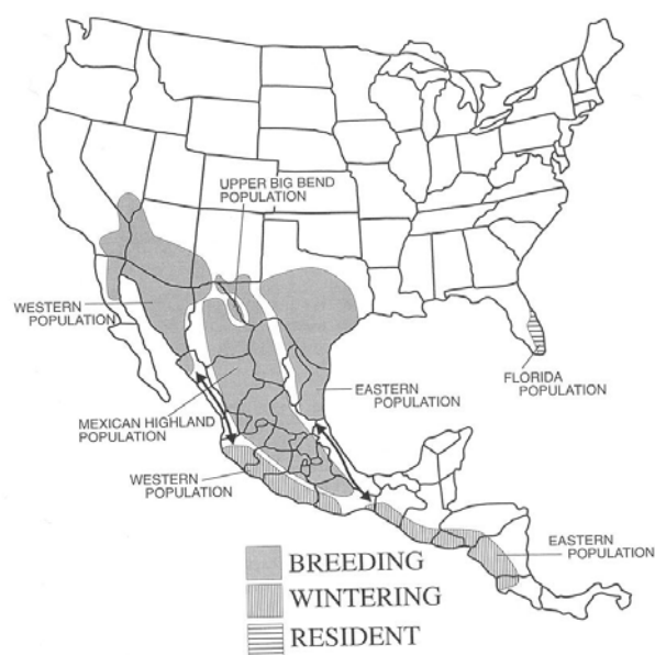
Figure. 1. The principal breeding, wintering, and resident area of migratory white-winged dove populations in North America, from George et al. (1994). Since George et al. (1994), white-winged doves have expanded their range into north-central New Mexico and southern Colorado. These new range expansions most likely are Mexican highland birds. The Eastern Population has expanded northward throughout most of the central United States.

The white-winged dove is one of 14 species of Columbidae occurring in North America north of Mexico (Aldrich 1993). Twelve subspecies of white-