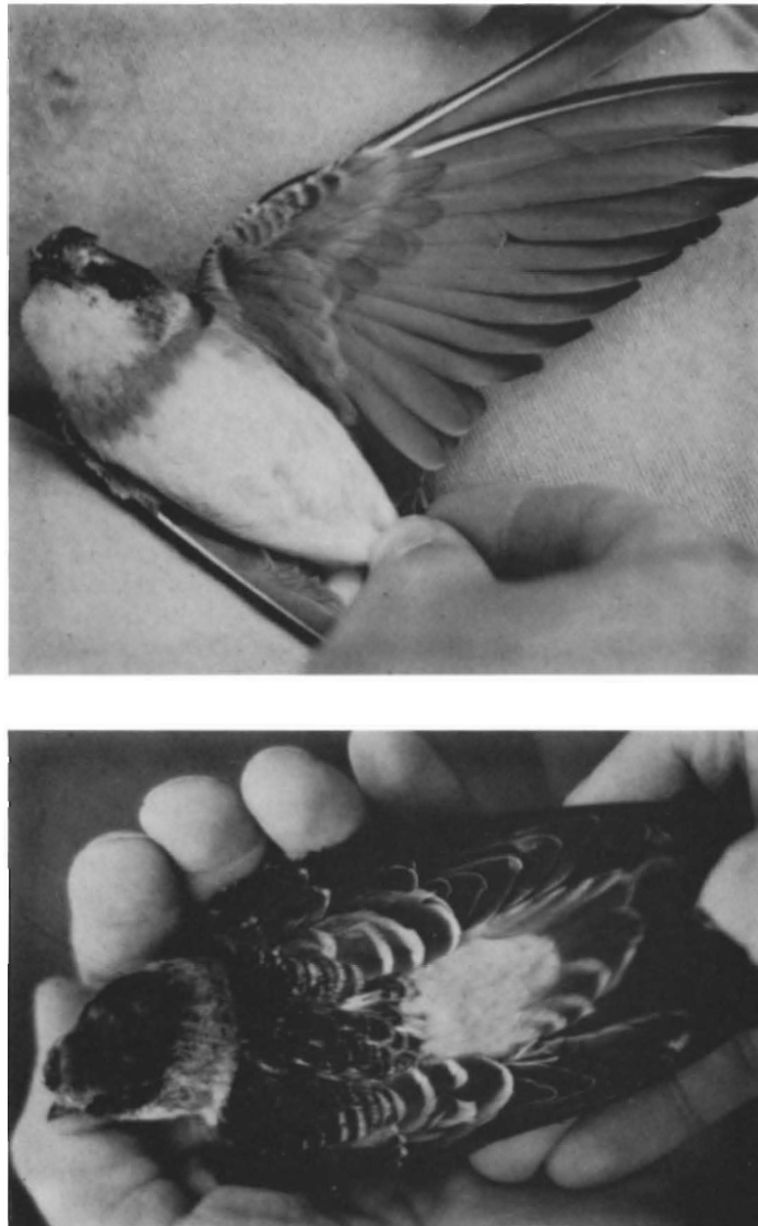
Fig.1. Ventral and dorsal views of juvenile Cave Swallow found in Garden County, Nebraska, May 31, 1991.