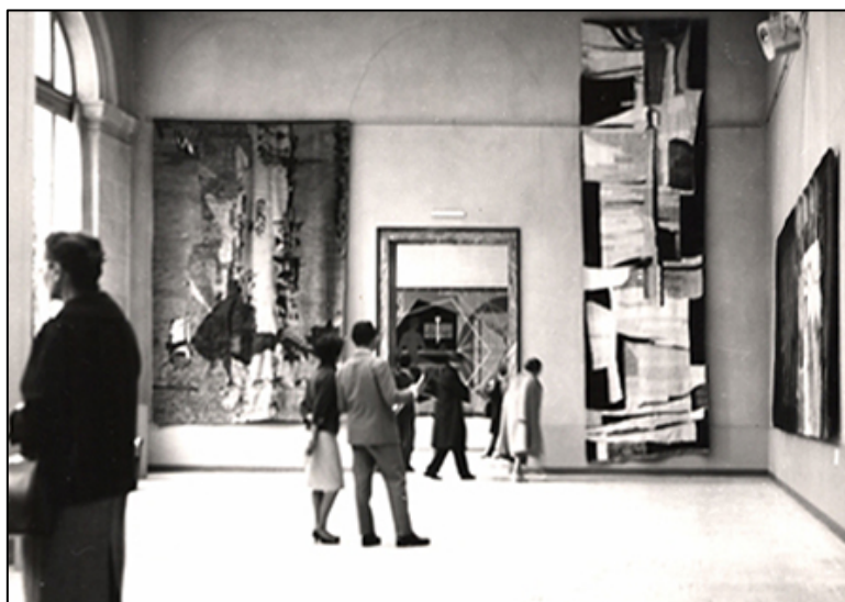
Figure 1 First Lausanne International Tapestry Biennial, 1962 Works by J. Owidzka, M. Abakanowicz and W. Sadley

be discovered by Western audiences. The Polish room at the first Lausanne Biennial (figure 1) aroused considerable interest, so let us investigate what lay behind that strong body of works.