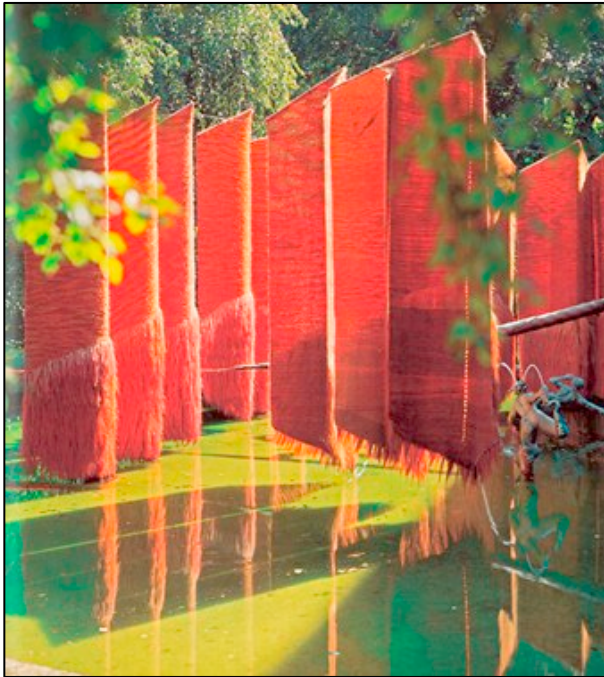
Figure 5 Jagoda Buić (Yugoslavia) Moving forms on water, 1973 330x130 cm (x15) 6th Lausanne Tapestry Biennial CITAM Archives

country as a theatre costume designer but later turned to textile art. After her Lausanne debut in 1965, she began weaving environments with heavy woven elements (figure 5).