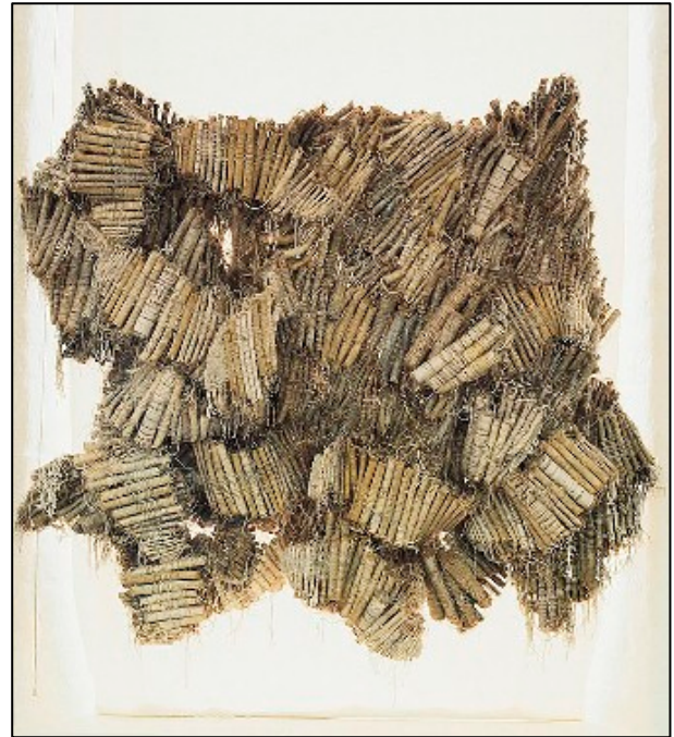
Figure 6 Ritzi and Peter Jacobi (Romania) Textile Relief, 1981 Cotton, goat hair, sisal, 155x170 cm

In Romania, the celebrated artist couple, Ritzi and Peter Jacobi, worked together during the 1960s and 1970s introducing new materials and inventing new techniques to achieve their artistic vision (figure 6). Much of the freshness of what soon became known as the ‘new tapestry’ movement lay in juxtaposing and rearranging various fibres with a focus on the material itself.