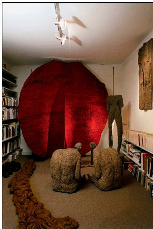
Figure 3 The Abakanowicz Room Pierre and Marguerite Magnenat Collection, Lausanne

The Polish artists who worked in tapestry in the 1960s were largely graduates of schools of painting and sculpture. Textile art was part of their culture but they looked at it with new eyes and moved in a dramatically new direction. They felt free to experiment with new materials and techniques, and were nicknamed the ‘new barbarians’.