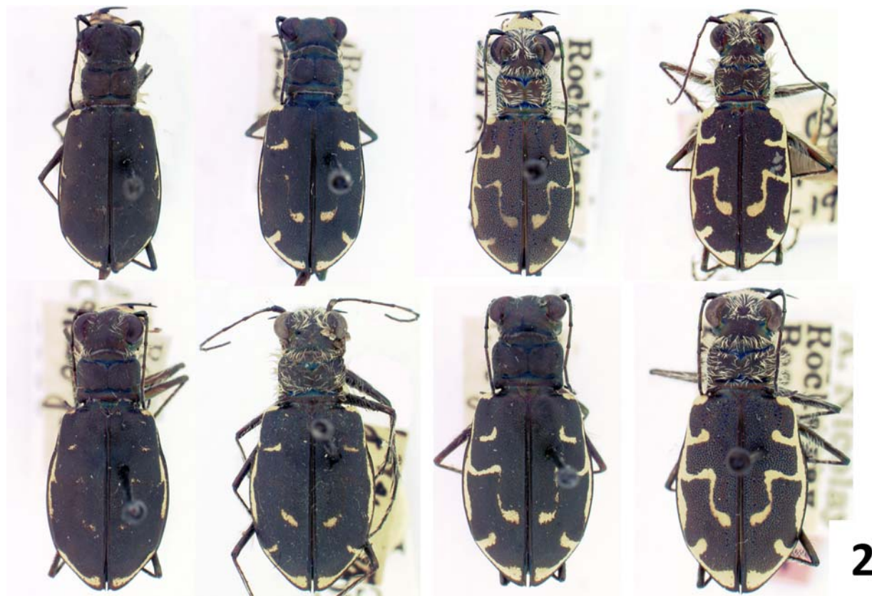
Figure 2. Adult specimens of Cicindela hirticollis Say collected at Rockaway Beach on Long Island between 1909 and 1932, showing variability in elytral color pattern ranging from the form described as C. h. hirticollis Say (right) to the form described as C. h. rhodensis Calder (left). Specimens in top row are males; specimens in bottom row are females.

deliberately chose to survey stretches of the larger beaches that showed the fewest signs of human disturbance.