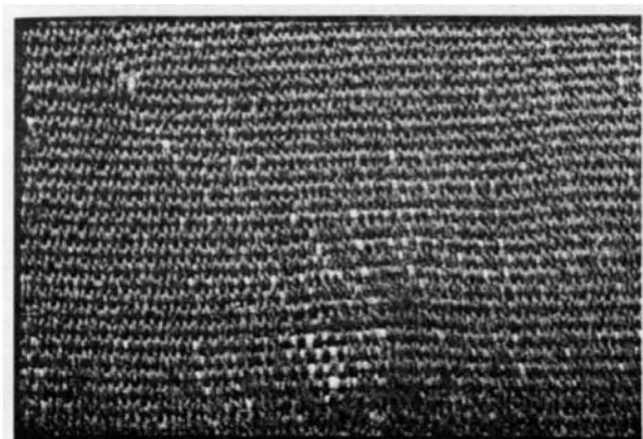
Figure 2: Detail of Mantle: Plainweave with black camelid warp, pink silk weft, 10x magnification.