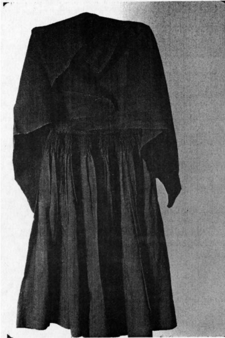
Figure 1: Tornosol dress (Collection of N. Kajitani) and Mantle (Collection of author).

opting of a valued attribute from one culture, by another. They in turn become one of the hallmarks of Andean cultural identity, and in doing so are testaments to the complex cultural interchange of the Colonial process.