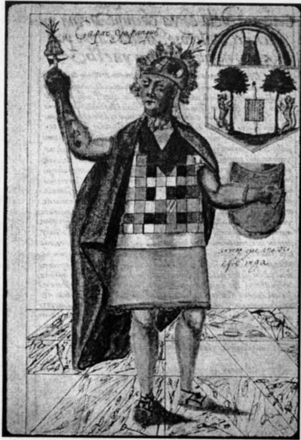
Figure 5: Capac Yupanqui with blue tornesol mantle. Marin de Murua, Historia General del Peru. J. Paul Getty Museum, Ludwig ms. XIII, 83MP159 folio 59r.