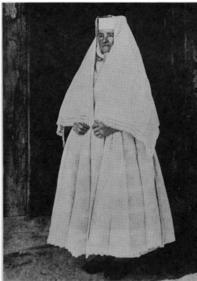
White mourning. Csököly, Hungary, 1926.

Right: Praying women in white, Košeca Valley, Slovakia, ca. 1930.