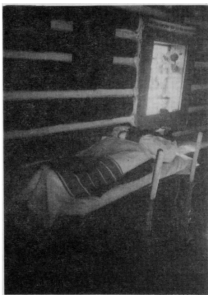
Right, below: Exhibit, Funerary objects; Čičmany, Slovakia.