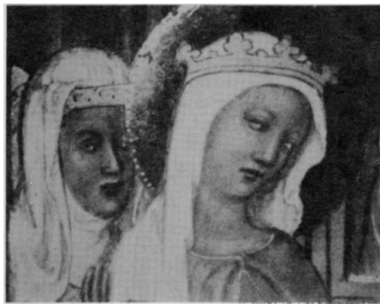
Right, above: Headdress of an older woman, ca. 1364. (in Gothic Woman's Fashion , op. cit.) Left, above: Headdress of an older woman, Čičmany, Slovakia, ca. 1930.