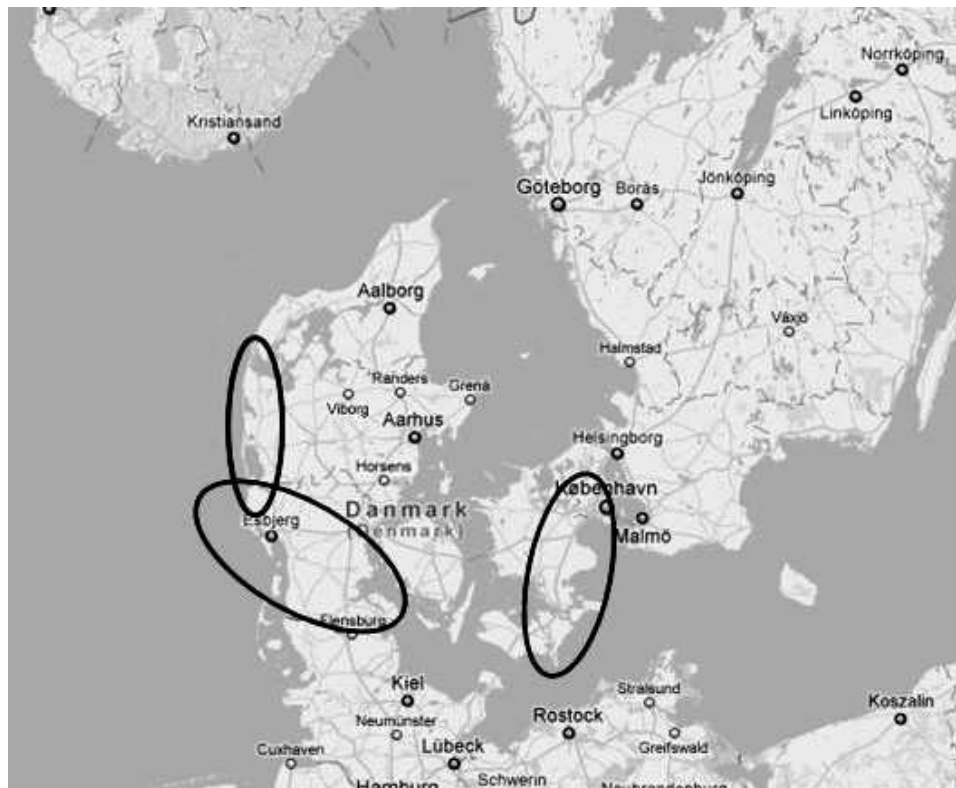
Fig. 1. Main sampling locations for AIV active surveillance in wild birds in Denmark.

Bird sampling. In Denmark, samples were collected mainly from Anseriformes (ducks, geese, and swans) and Charadriiformes (gulls, terns, and shorebirds) wild birds and from dead birds of prey (Table 1). In 2007, the target species were defined as species that could occur near poultry farms. The focus was on Passeriformes species, which have a high probability of contact with poultry, but also raptors, owls, pigeons, and waterfowl. From 2008 onward, the European Commission guidelines were followed (Decision 2007/268/EC of 13/IV/2007, object C), focusing on larger bird species, especially water birds such as swans,