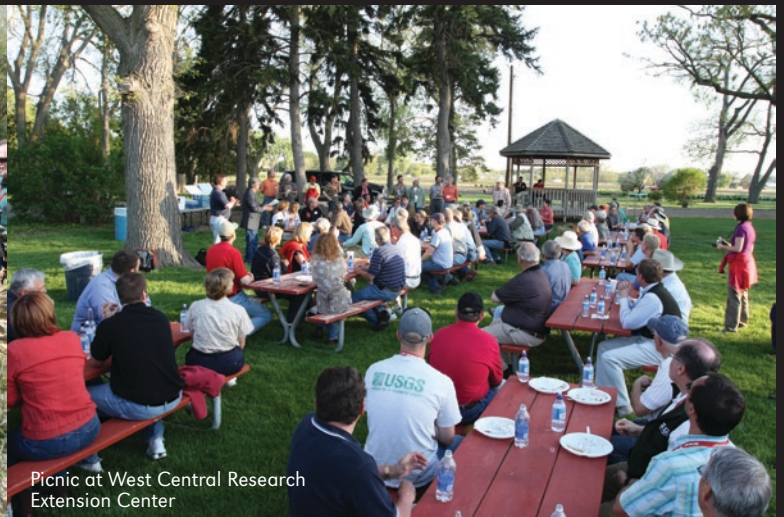
Picnic at West Central Research Extension Center