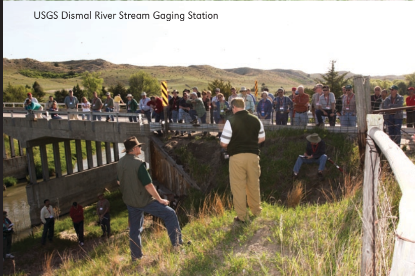
USGS Dismal River Stream Gaging Station