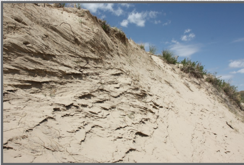
Sand dune blowout

Resilience theory has been developed by ecologists over the past three decades to explain the surprising and nonlinear dynamics of complex adaptive systems. Resilience theory is the basis for adaptive management, a management approach developed to address the uncertainty of complex resource systems and is applicable to the challenges managers will face in a changing climate. Climate change could alter rainfall patterns, transpiration rates and temperatures – changes that will be reflected in plant and animal distributions. Complex social and ecological systems are maintained by the interaction of biotic and abiotic elements at critical scales. Changes in climate variables that affect the distribution of plants and animals or cropping systems can push these systems beyond their resilience – past a critical threshold – creating rapid and nonlinear responses to climate change. Anticipating, mitigating and avoiding these thresholds are important to maintain the viability of these systems. Maintaining the resilience of the entire system should be the management goal rather than focusing on maintaining certain variables in a relatively constant state.