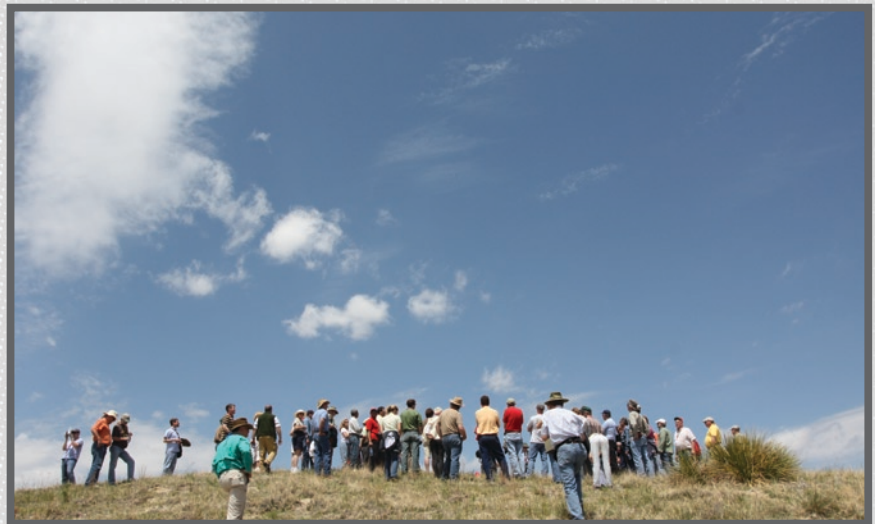
Touring the Sand Hills

Climate Change Past, Present and Future: the Nebraska Sand Hills as a Sentinel System