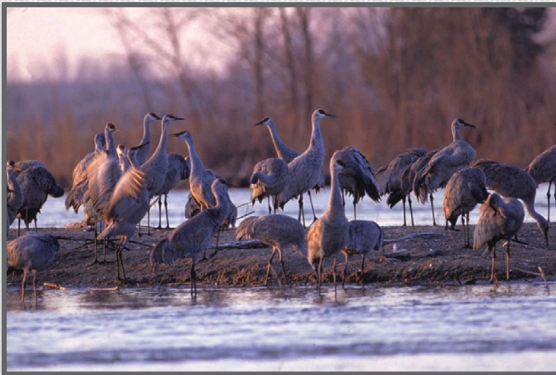
Sandhill cranes in the Platte River

The Platte River rises from snowpack in the Rocky Mountains and flows 900 miles across the plains, fed by tributaries whose source is the High Plains aquifer and emptying into the Missouri River at Plattsmouth, Neb. The Platte River Basin drains an area of almost 90,000 square miles that sustains thousands of acres of lakes and wetlands, and provides a staging and resting area for the North American Central Flyway, which is vital to the survival of a majority of Western Hemisphere waterfowl.