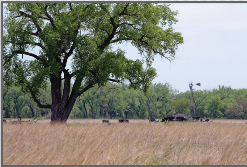
Platte River Valley

and cultural resources. Efforts such as the Platte River Cooperative Hydrology Study, a multi-agency, multi-state study aimed at developing computer models to increase understanding of the relationship between ground and surface water in the Platte River Basin, need to be extended throughout the Platte River, High Plains aquifer and Sand Hills ecosystems. Expanded, long-term monitoring of the ecological communities of the region is needed to provide the basic information required for ecological models. Retrospective analysis of ecological data and paleo-science examining long-term evidence of past climatic conditions and effects provide critical information.