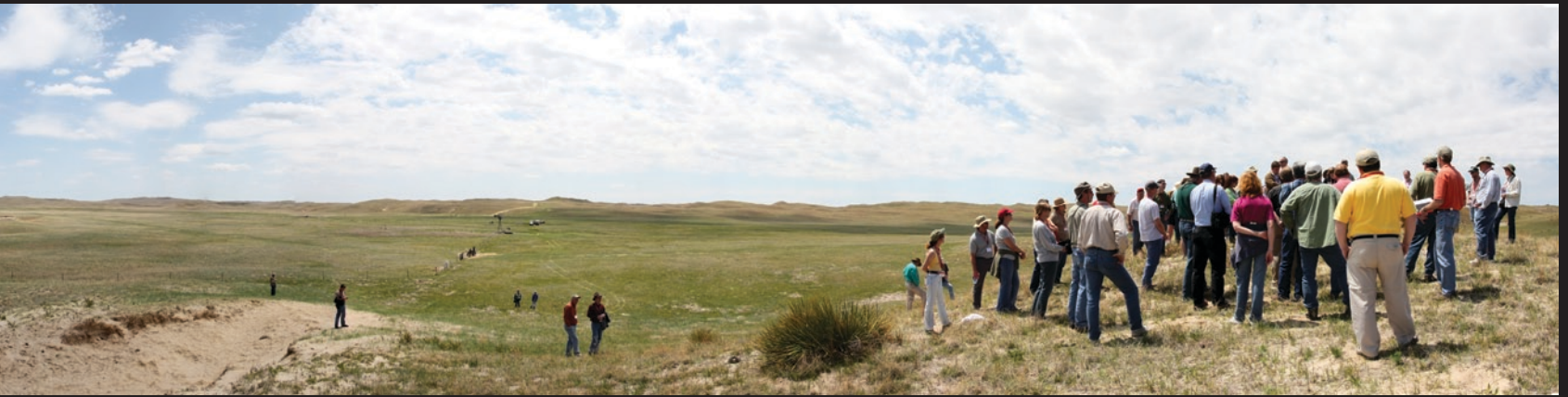
Gudmundsen Sandhills Laboratory