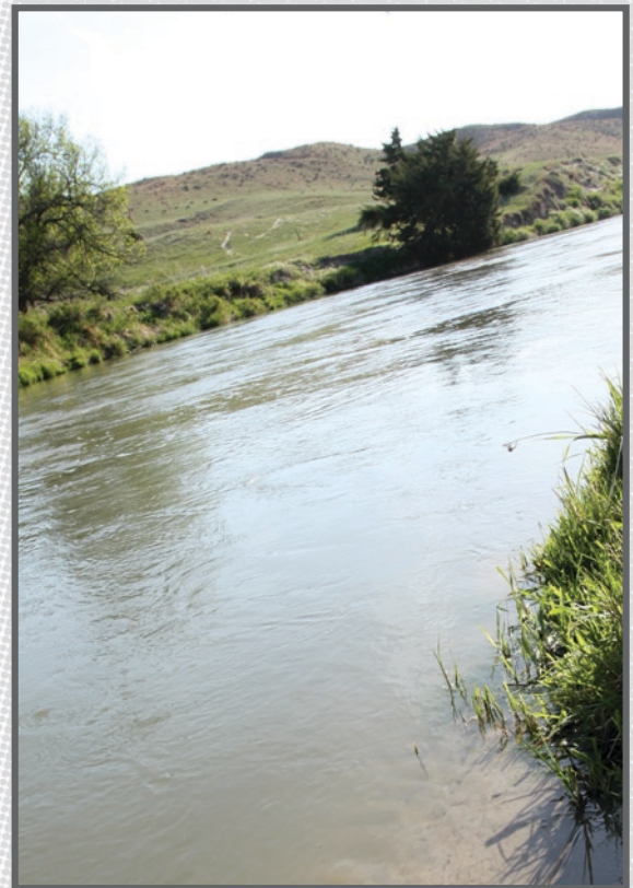
The Dismal River

Climate Effects on Water Availability for Human and Ecological Needs