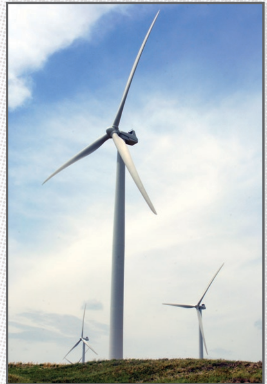
NPPD wind turbines near Ainsworth, Neb.