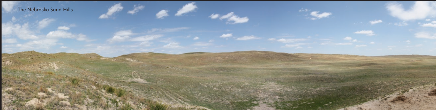
The Nebraska Sand Hills