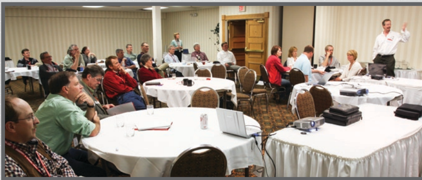
Breakout group discussion

A cross-disciplinary research program will require a coordinated systems approach to determine the components and critical scales responsible for creating resilience and to guide modeling and manipulations. Particular study sites will need to be identified; the Sand Hills is a system of low resilience and relatively little human impact, and the Platte River Valley is a system with heavy human impact, water shortages and complex social economic systems. An effective adaptive management plan will monitor and manipulate each of these systems on multiple scales and assess predictions, feedbacks and sensitivity.