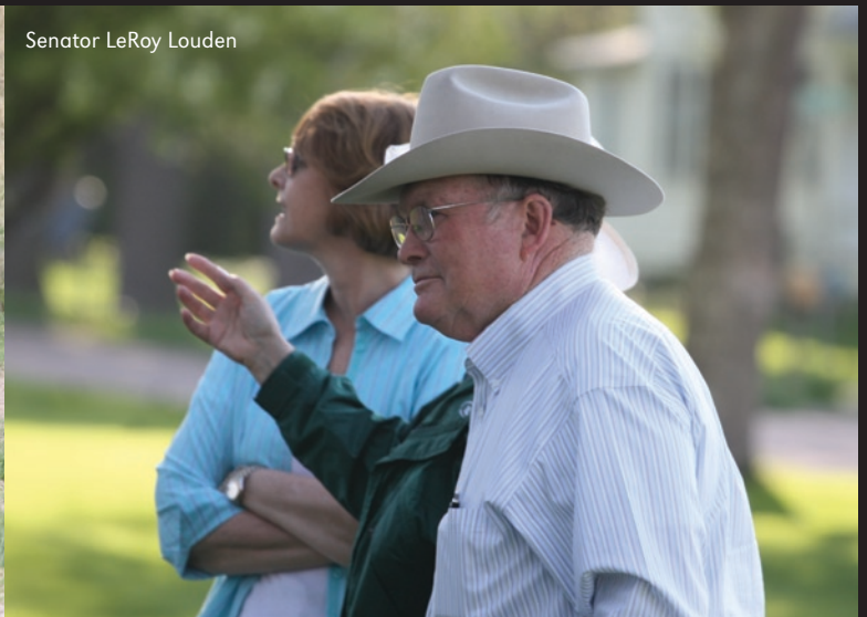
Senator LeRoy Loudon