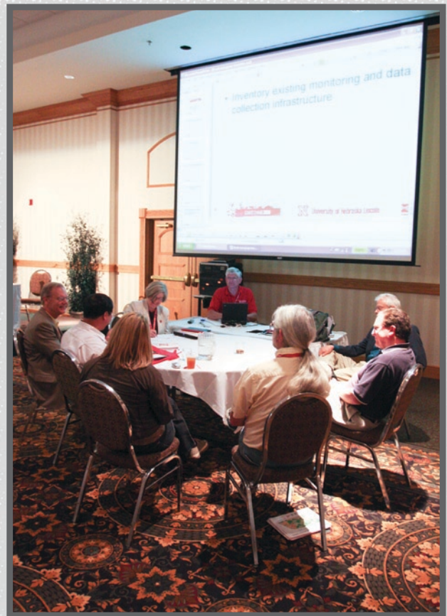
Breakout group discussions