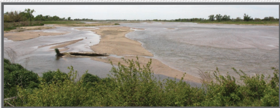
The Platte River

Changes in water and land use, a prolonged seven-year drought and increasing demands for irrigation have reduced flows in the Platte River, transformed its channel and altered adjacent wet meadows. These changes in the hydrology of the river and the structure of riparian habitats raise questions about the sustainability of migratory and resident bird species and other wildlife in the basin. The increasing global demand for crops for food and fuel and urban expansion at the western and eastern ends of the river puts greater demand on water resources for irrigation, industry and households.