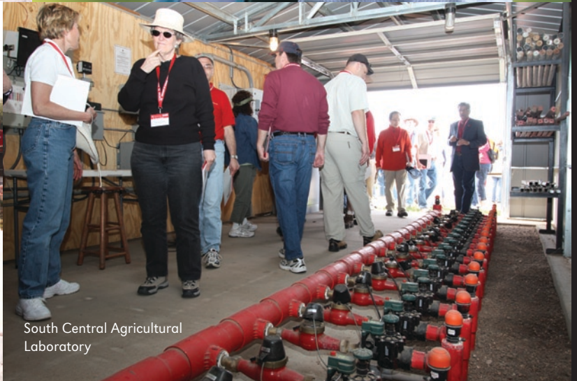
South Central Agricultural Laboratory