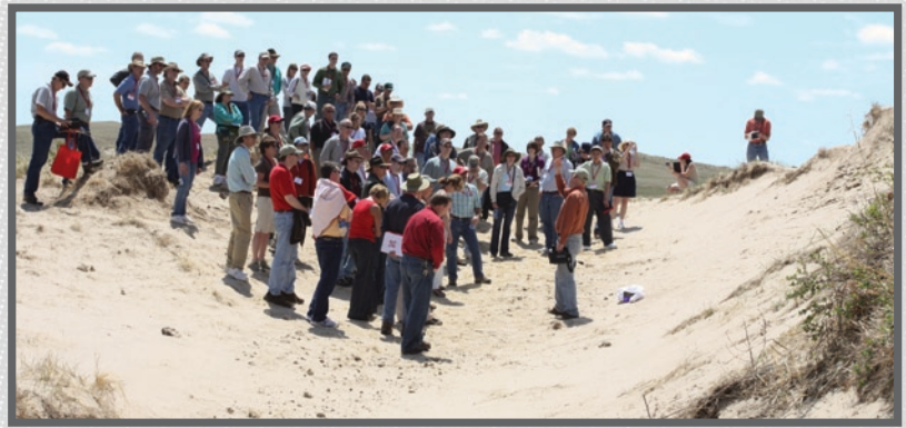
Dune blowout in the Sand Hills

The Nebraska Sand Hills and the High Plains Aquifer