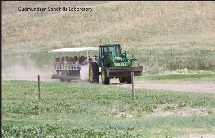
Gudmundsen Sandhills Laboratory