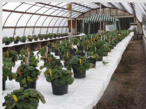
Figure 1. Benches were 6 feet wide by 60 feet long and held 156 plants per bench.

Some cultivars such as 'Sweet Charlie' and 'Albion' were highly susceptible to spider mite infestation, but still flowered and fruited. 'Albion', 'Strawberry Festival' – July and August, and 'Sweet Charlie' were the first to bear harvestable fruit (3/3/10). This was approximately 7 weeks after repotting. Berry color as gauged on the RHS color chart was generally at 46, 45, 44 (dark red group) and/or 34 (dark orange-red group). Often one berry would have two colors depending on which side you viewed. Upon harvest, all cultivars, at some point, produced berries that still had white flesh around the calyx.