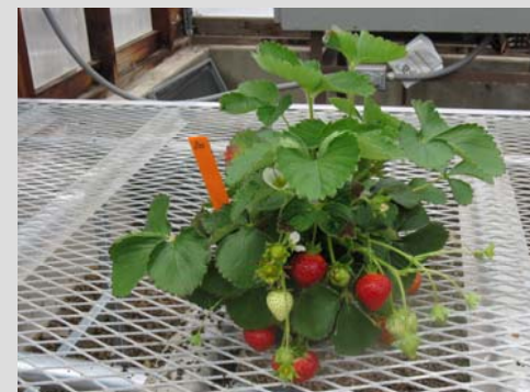
Figure 3. Cultivar AC Wendy.