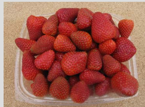
Figure 4. Example of harvested berries.

This research was funded in part from Nebraska Department of Agriculture Specialty Crop Block Grant Program and the USDA/CSREES Multistate project NE-1035 "Commercial greenhouse production: Component and System Development".