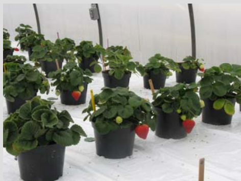
Figure 2. Plants were grown on a capillary mat covered by white plastic in order to increase reflected light.

Twelve strawberry cultivars, some day neutral and some short day responsive, were grown from September through late April. In phase I, all plants were potted in a soil-lite mix in 6-inch pots, watered as needed and grown in a glass greenhouse as part of a student laboratory experience. In phase II, 24 plants of each cultivar were selected based on similar leaf number and uniform plant size. All runners, flowers and fruit were removed, and plants were replanted in new soil-lite mix and placed across two benches in a poly-covered greenhouse. The phase II experiment was set up as a randomized complete block design with 6 replications of four plants per cultivar, 3 replications running north-south on each bench. Data taken included: date of first flower, total fruit number, and berry weight per plant. Berries were deemed ripe based on color comparison between berries purchased from the grocery store and those on the bench. This was standardized by using the RHS color chart. Bees ( Bombus impatiens ) were introduced when the first flowers started to open.