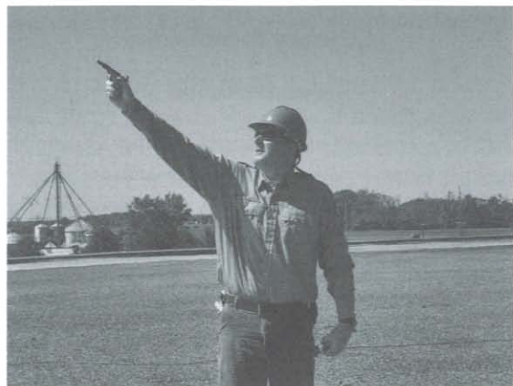
Fig. 4.1. Biologist firing a pyrotechnic device from a specially designed pistol. Pyrotechnics are widely recognized as effective wildlife control tools when used as part of an integrated control program.

limited by context as well as by species behavior and ecology.