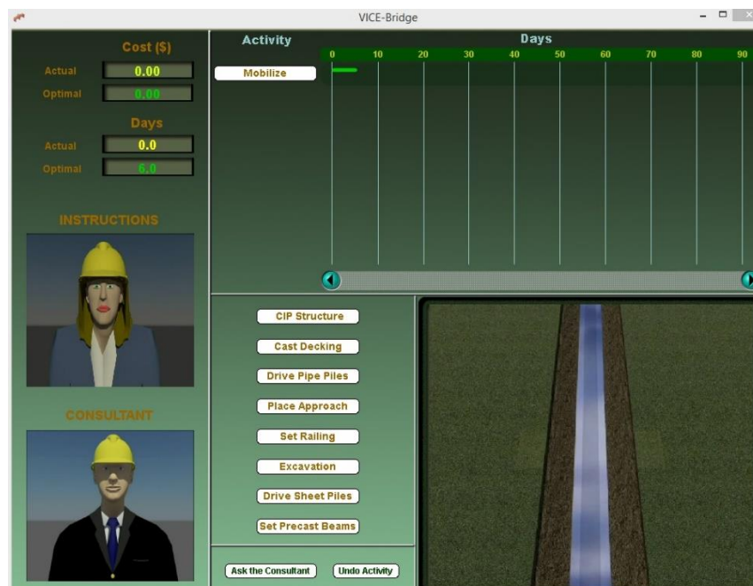
Figure1: Main page of VICE

After finishing the pre-quiz section, students play the main simulation. The first page of the main simulation is a set of demographic questions, and then students are directed to the main page of VICE (Figure 1).