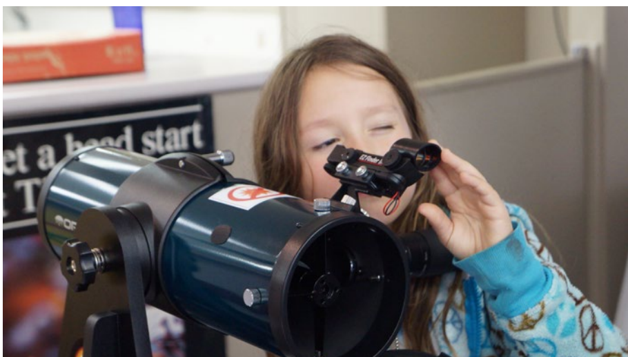
A budding astronomer inspects one of the two new telescopes available for check-out at the Morton-James Public Library

In the spirit of transformation and community involvement, our one-day library provided space for a variety of community organizations to help them spread the word about the programs and services they offer. In addition to providing brochures and information regarding the Arbor Day festivities, we hosted tables and display space for the Nebraska City Museum Association, Southeast Community College and the Nebraska City Youth Collective. Additionally, a representative from the Memorial Building Restoration Project accompanied