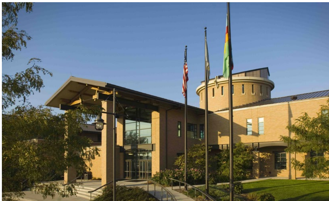
Built in 1999, this alluring facility houses The Sarpy Center and La Vista Public Library.

Fast forward several years and many meetings to December of 1999 and a new facility. The library is housed on the south side of the building located almost two miles away from the old site near city hall. The old library was 4,000 square feet. The new library facility is 23,316 square feet and built with not one penny of taxpayer dollars. La Vista has KENO. Due to Nebraska Department of Revenue’s Charitable Gaming Regulations, any city shall spend the proceeds of the lottery only for community betterment purposes. What could be better than a library?