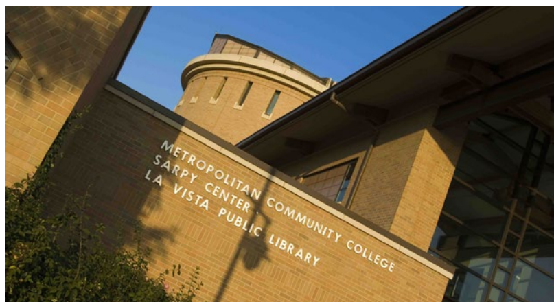
The Sarpy Center and La Vista Public Library serve Metropolitan Community College students, city library users, and community members.

MCC and the library have recently worked together on joint projects including a city coloring book and finals week’s events. The Sarpy Dean has acted as a judge during the city’s Salute to Summer Festival and MCC has included their MCC VW bug in the city’s parade lineup. The dean and library director meet throughout the year to keep each other posted on what is going on in their communities and look for other opportunities to enhance the students’ and library users’ lives. One advantage to MCC is the availability of library staff members who can proctor student exams. In the last year alone, 73 tests have been administered.