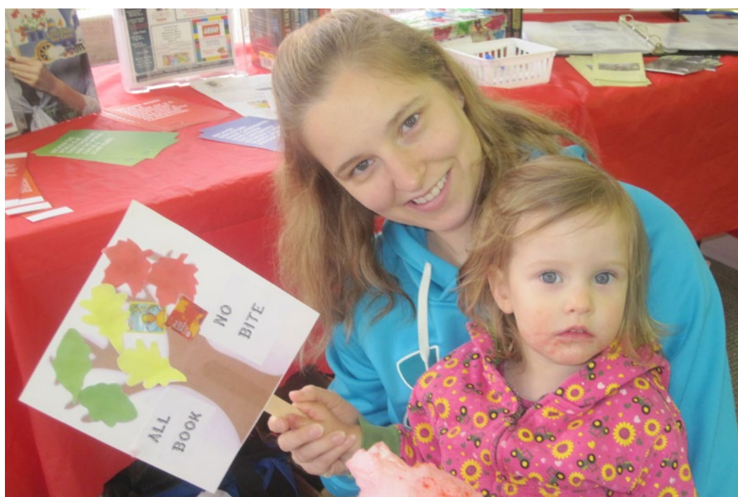
A mother and daughter display their craft and enjoy cotton candy provided at the “Morton-James on Main” Arbor Day library.

How did this unique, one-day library event come about? In anticipation of the holiday weekend, the library staff brainstormed ideas about what the library could do as part of the Arbor Day festivities—while also endeavoring to relate our activities to the ALA’s Libraries Transform campaign. It was mentioned that several local civic