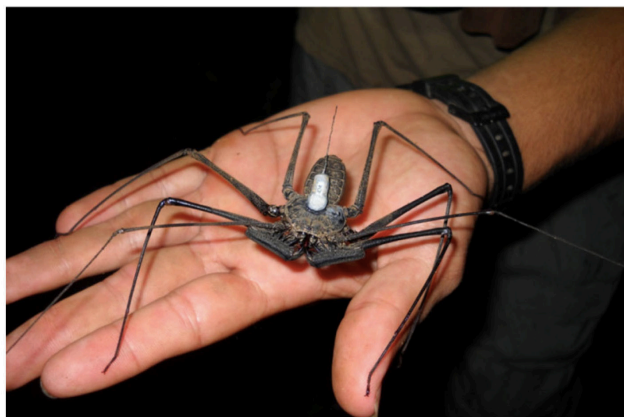
Fig. 2 Photograph of P. pseudoparvulus fitted with a radio transmitter

The focal tree for each resident/non-resident pair was searched at dusk and for 2 h afterward on each of the four nights fol-