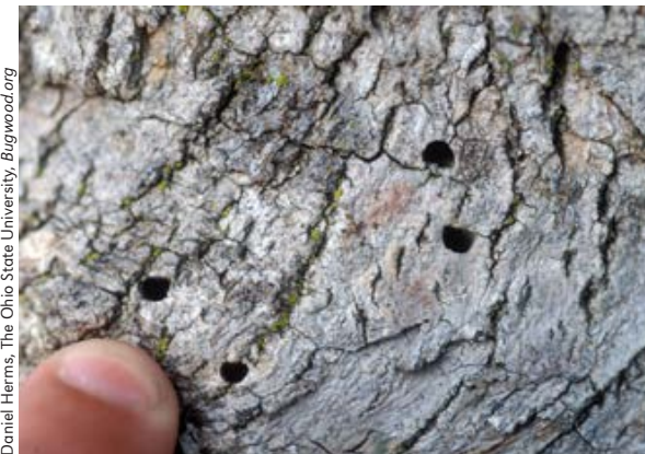
'D' shaped exit holes

cracks occur vertically, or up and down the trunk, over a dead bark section. Woodpeckers are often attracted to infected trees, and peck into the bark in search of borer larvae. So woodpecker damage in an ash tree could also point to a developing EAB infestation.