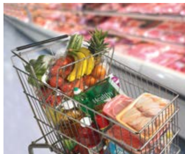
USDA Food Safety and Inspection Service

Try beans for a less expensive protein food. For vegetables, buy carrots, greens or potatoes. As for fruits, apples and bananas are good choices.