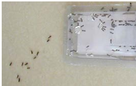
Odorous house ants feeding on bait.

In early spring, food outdoors is limited and ants may come indoors looking for food. To control ants, you must treat the colony. Killing a few ants with an over-the-counter insecticide spray won't solve the problem.