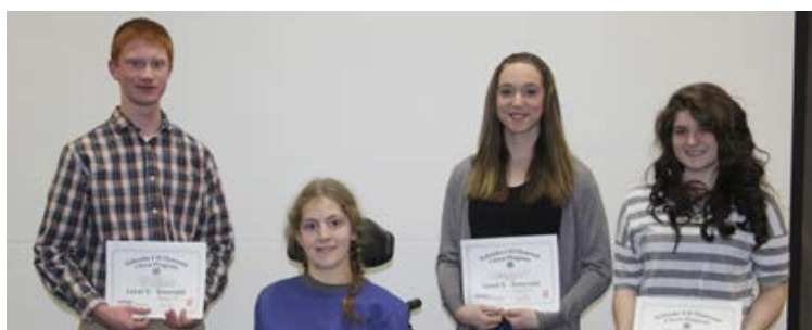
Level 5 – Emerald