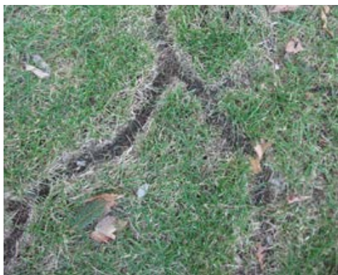
Surface runway system of the prairie vole.

Voles and rabbits will damage plants in early spring when it is hard to find