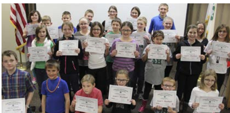
Level 1 – Amethyst