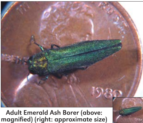
Adult Emerald Ash Borer (above: magnified) (right: approximate size)

As insect tunneling occurs under the bark, sections of bark die and often crack. These