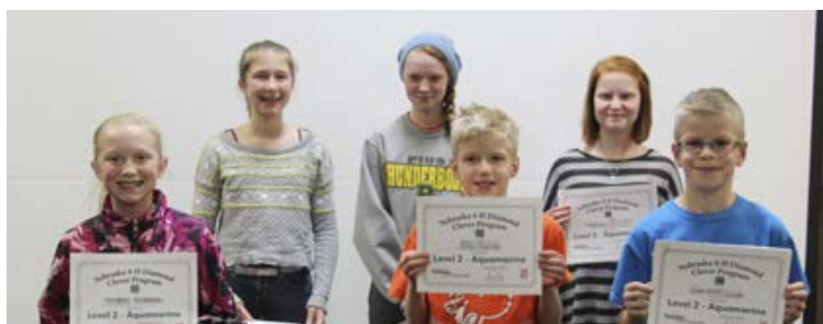
Level 2 – Aquamarine