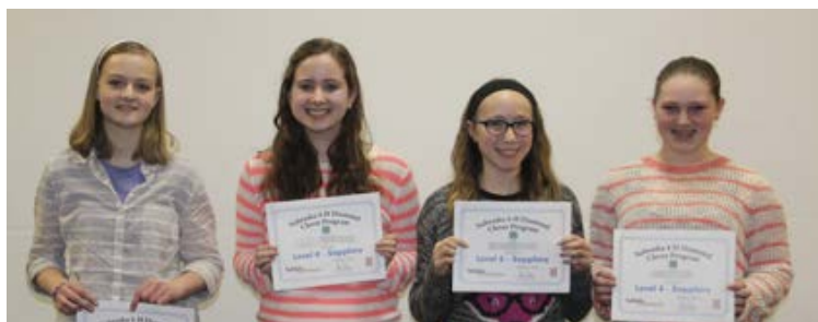
Level 4 – Sapphire