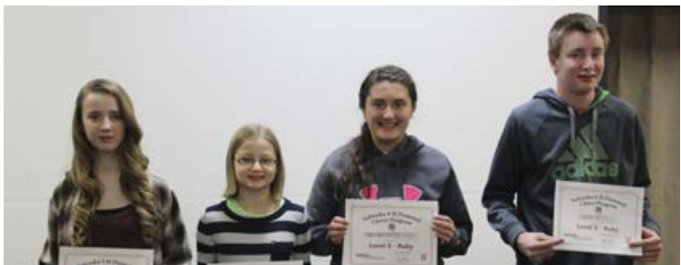
Level 3 – Ruby