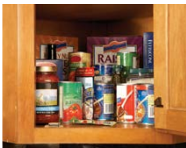
USDA Food Safety and Inspection Service

Before you head to the grocery store, plan your meals for the week. Include meals like stews, casseroles or stir-fries, which “stretch” expensive items into more portions. Check to see what foods you already have and make a list for what you need to buy.