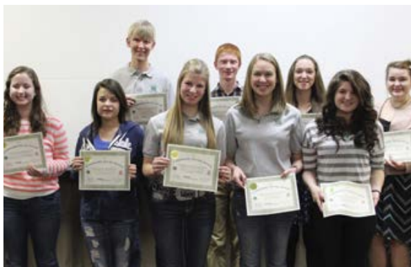
Age 14 and over