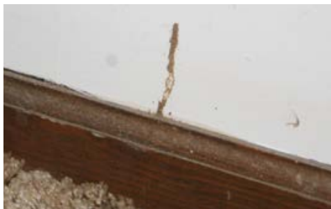
Termite mud tube on a basement wall

As we ease into April, be on the watch for termites. You may never see swarming termites, but you may find long wings left along a windowsill. Keep watch as you start a little spring cleaning. Look for mud tubes along walls in garages and basements. If you find shed wings or an insect you don't recognize, we'd be happy to identify it for you.