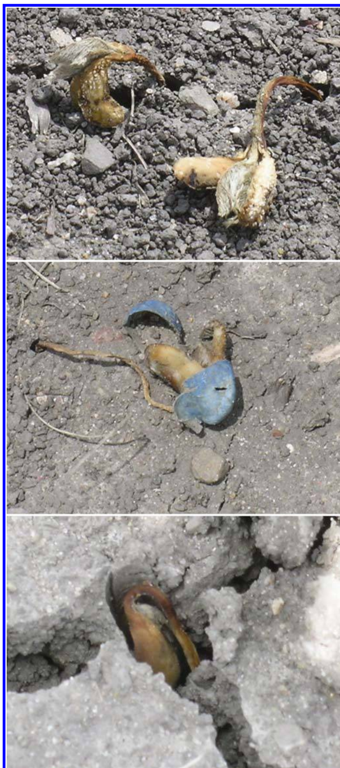
Fig. 2. Soybean seedlings with symptoms of damping-off caused by Phytophthora sojae on both treated and nontreated seed. Note the presence of seed coat above soil surface following germination of seedlings.

and candidate lines to root rot caused by P. sojae . P. sojae isolates from the field study locations contained a complex virulence formula as demonstrated by their ability to infect soybeans with Rps1a , 1k, 6, or 8 as well as additional differentials. In 2004, three seed treatments including mefenoxam, 3.75 g a.i. and fludioxonil, 2.5 g a.i./100 kg seed (Apron Maxx RTA); mefenoxam, 3.75 g a.i. and fludioxonil, 2.5 g