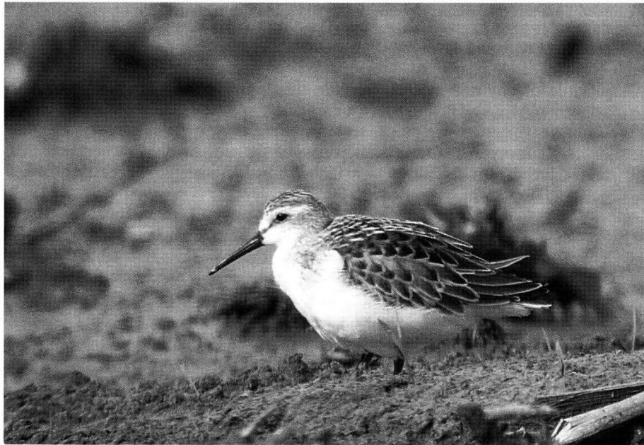
A nice photograph of a juvenile Western Sandpiper in Adams County 25 August.

Spotted Sandpiper: Fourth-latest on record was one at PL 1 Nov (JGJ, CG); most leave by mid-Oct.