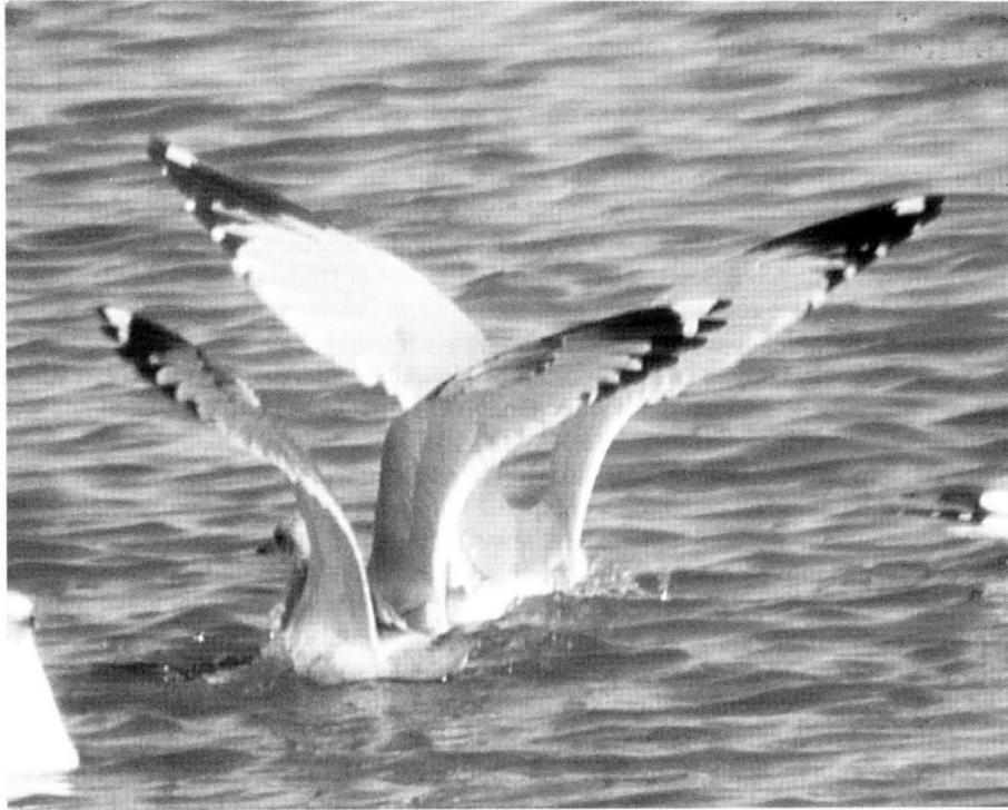
This interesting photograph of a near-adult Mew Gull (left) and a Ring-billed Gull provides an excellent comparison of mantle colors and outer primary patterns; it was taken by Paul Dunbar at Alma 29 Nov.

Eurasian Collared-Dove: Now that this species is ubiquitous in Nebraska, we resort to reporting large fall and winter counts; best were a flock of 80 in Broken Bow 14 Nov (TH) and 50 in Valley Co 25 Oct (WF). The 4 highest counts to date (77-200) are in the period mid-Nov through mid-Feb.