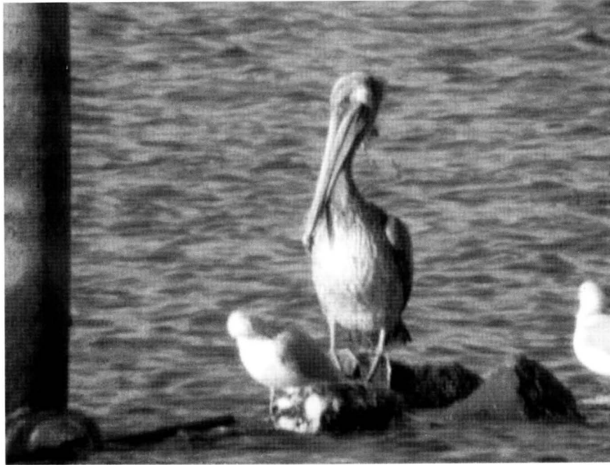
This juvenile Brown Pelican was at Harlan County Reservoir 19-23 October (19th October; Glen & Wanda Hoge); it was Nebraska's sixth documented record.

Western Grebe: LM hosted 2830 on 4 Nov (SJD); 218 were at Sutherland Res the same day (SJD). These are good counts for Nov. Easterly were singles at PL 26 Oct (JGJ) and BOL 21 Nov (JGJ).