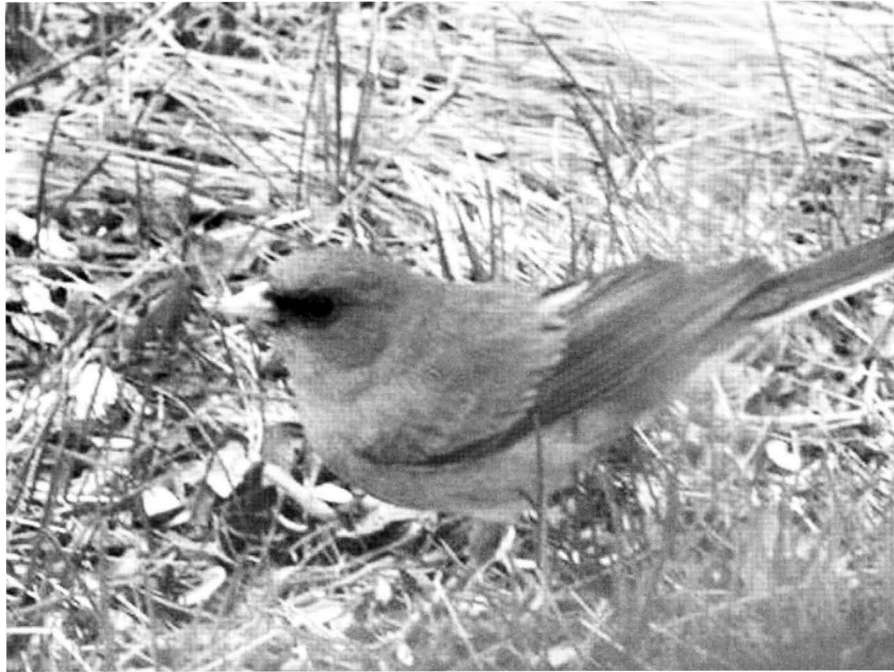
Dark-eyed (Gray-headed) Junco, Wind Springs Ranch, Sioux Co., 7 May 2009.

White-throated Sparrow: Routine reports.