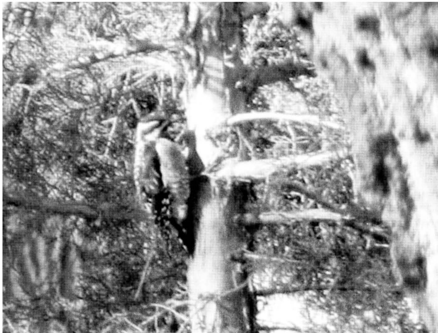
Red-naped Sapsucker, Wind Springs Ranch, Sioux Co., 18 May 2009.

Red-bellied Woodpecker: Routine reports.