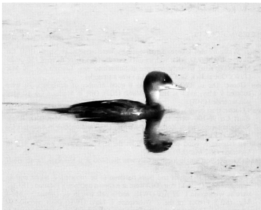
Hooded Merganser, Lincoln Saline Wetlands Nature Center, Lancaster Co., 25 May 2009.