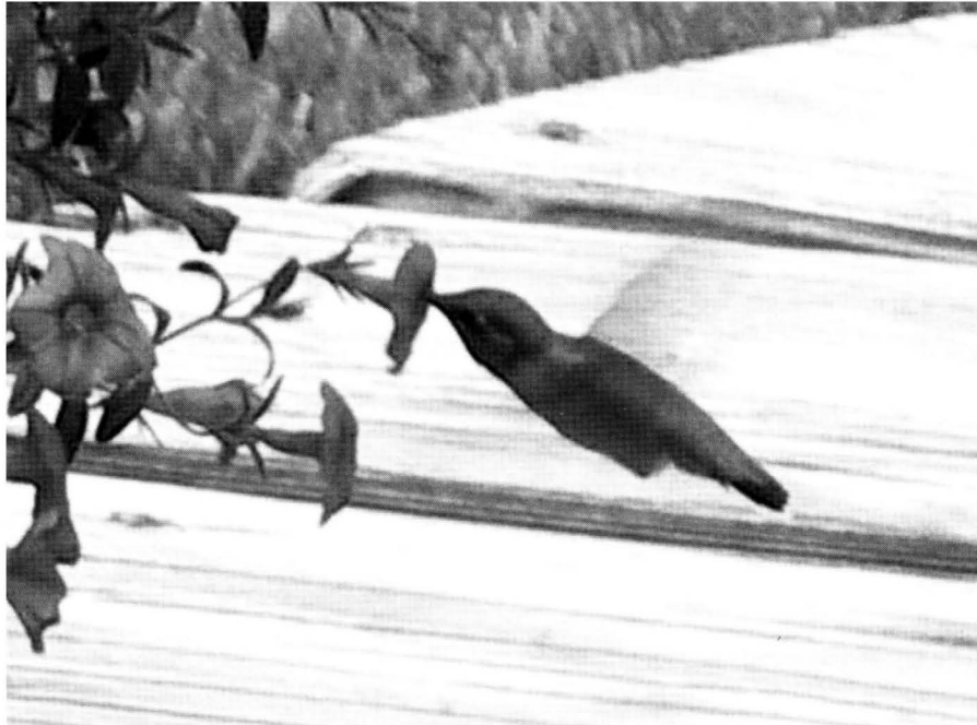
Female Ruby-throated Hummingbird, Ogallala. 14-15 Aug 2009.

Red-headed Woodpecker: A juvenile in Dixon Co 4 Nov (JJ) was rather late for ne Nebraska.