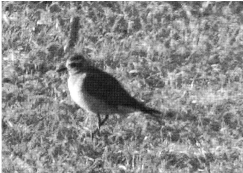
American Golden-Plover, Buffalo Co, 12 March 2011. Second-earliest record.