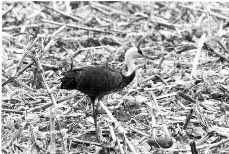
Hooded Crane, Hall County, Nebraska, April 8, 2011.