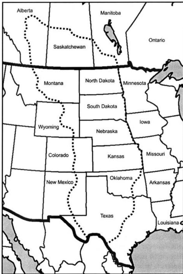
Figure 1. Simplified map of the Great Plains, showing boundaries.

loose bark of trees, rotted logs, rock crevices, beneath stones, and bird and rodent nests. They prefer moist, organic habitats in which other small invertebrates thrive. In their feeding habits, pseudoscorpions are limited to smaller prey, such as tiny insect larvae, springtails, mites, ants, booklice, small worms, and other soft-bodied micro-invertebrates. They are limited in their ability to disperse, but many pseudoscorpions hitchhike great distances by grasping onto beetles, flies, and moths (Weygoldt 1969; Muchmore 1990; Beccaloni 2009).