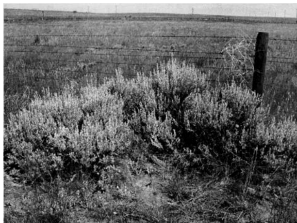
Figure 3. Sagebrush ( Artemisia tridentata ), habitat for pseudoscorpions.

Following is a list of 52 records. Each record includes state, county, location, and collector, if known. Fifteen new state records, as indicated with an asterisk (*), were determined as a result of this study.