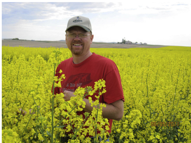
Fig. 1. Winter canola in an on-farm field experiment near Davenport, Washington in 2011. Horned larks did not infest this site. Long-term experiments at this site (455 mm annual average precipitation) have documented rainfed winter canola seed yields as high as 4250 kg/ha. Winter canola is considered the most important feedstock for biodiesel production in Washington.