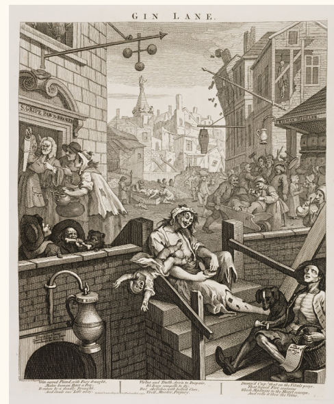
Hogarth, Gin Lane