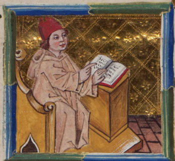
De exceptionibus. Rubrica