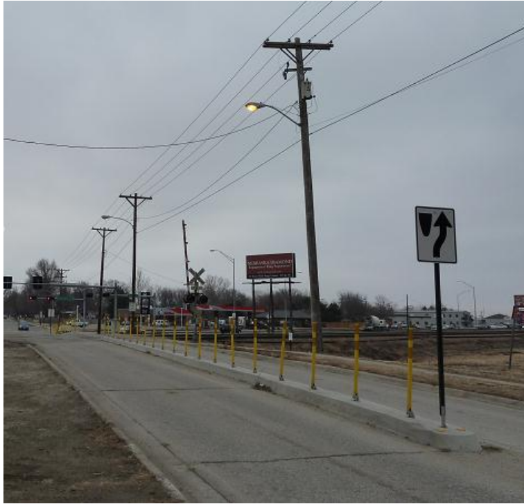
Figure 5.1 Installation of Median Barrier on Raised Concrete Curb at an HRGC