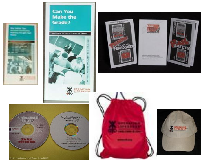
Figure 3.15 A Sampling of Operation Lifesaver Educational Material Used in the Campaign

The Fremont educational campaign was undertaken for two days on September 29 and 30, 2011 to ensure capturing pedestrian and bicyclist traffic at the crossing. Video footage was captured one week before and after the educational campaign. Significant pedestrian and bicyclist traffic was observed at this location (fig. 3.16), which was partly due to users spreading information about the campaign via word-of-mouth in the community. Figure 3.16 shows distribution of educational materials and conversations amongst research team members and the public. A significant number of materials were distributed during the two days of the campaign and therefore, the research team considered the campaign successful in reaching out to the users.