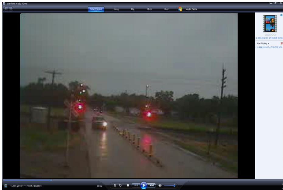
Figure 3.9 Vehicle Passing Under Descending Gates (Violation Type 1)

were collected for each vehicle/pedestrian/bicyclist observed at the crossing. These were then aggregated to obtain statistics for each train crossing event. The aggregated variable list also appears in Appendix A (table A.2).