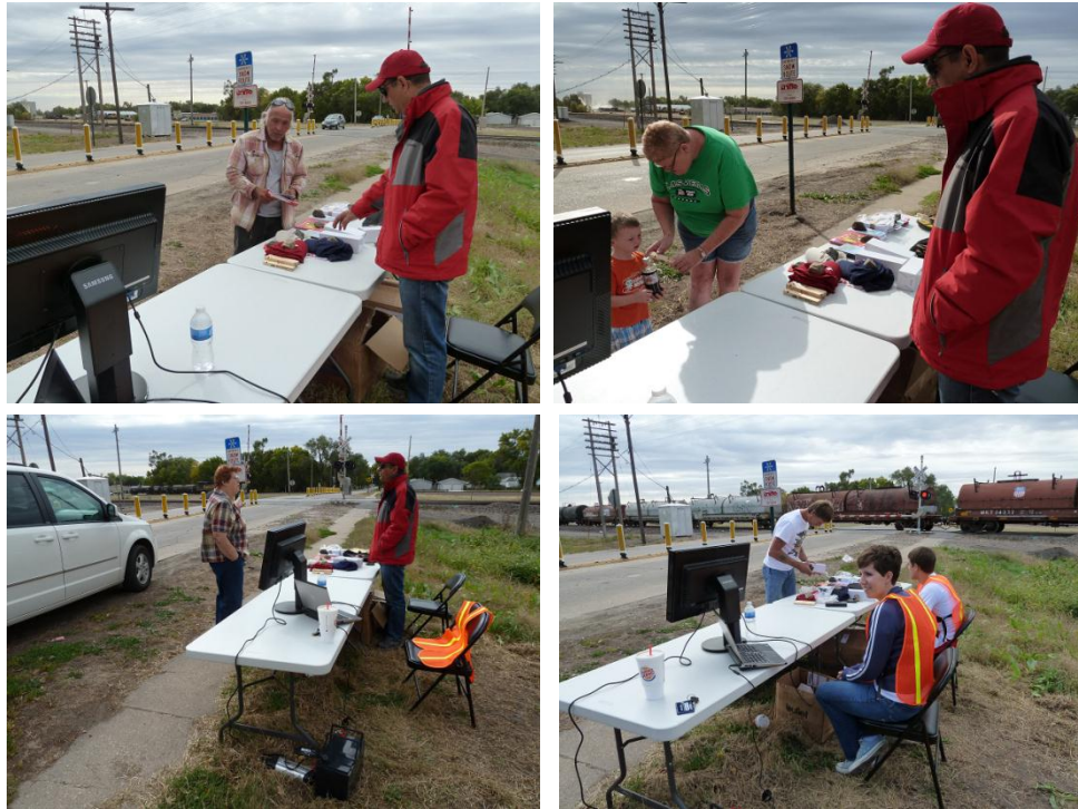
Figure 3.16 Education Campaign at the Fremont HRGC