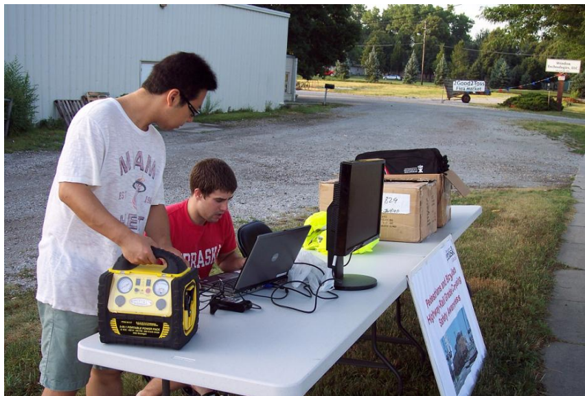
Figure 3.14 Preparing for the Educational Campaign