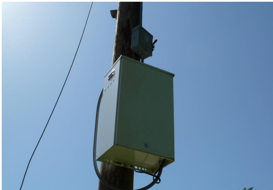
Figure 3.4 Digital Video Recorders (DVR) Housed in Metal Box