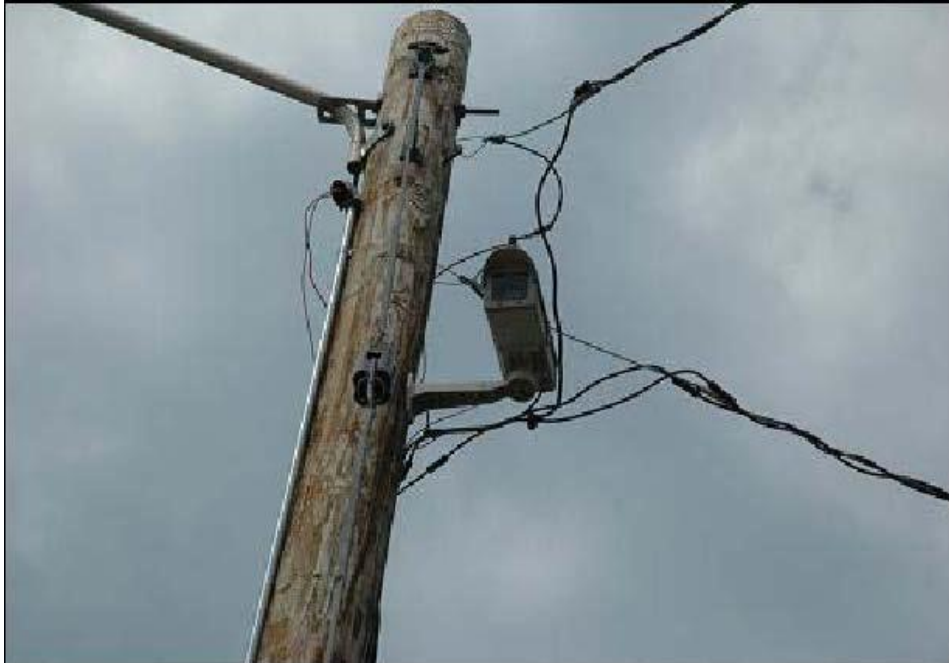
Figure 3.3 Camera Installed at HRGC to Capture Crossing Maneuvers