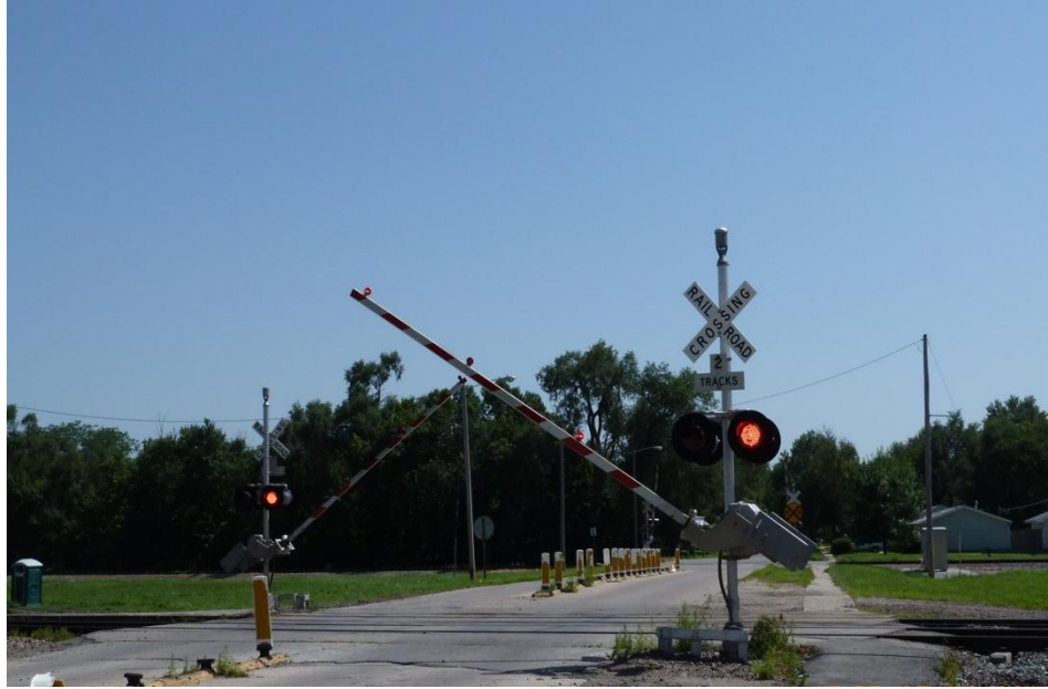
Figure 3.2 M St. Crossing in Fremont, Nebraska

Each crossing was monitored for motorists' unsafe maneuvers using day- and night-vision cameras and digital video recorders (fig. 3.3 and fig. 3.4, respectively). At the Waverly crossing, a median barrier, consisting of vertical plastic plates and a flexible rubber base, was installed in December 2005 on both sides of the tracks. The barriers on both sides were removed in December 2007 at the request of the City of Waverly officials. The reasons cited were the dilapidated barrier condition (fig. 3.5) and complaints from businesses in proximity of the crossing. Data pertaining to unsafe motorist maneuvers were collected in 2006 and 2008 and therefore, the comparison showed the effect of their removal after being in place for a prolonged period. At Fremont, the barriers were left in place but no maintenance was performed and the condition of the barriers steadily eroded (fig. 3.6). Therefore, a 2006 versus 2008 comparison indicated changes in safety due to lack of maintenance.