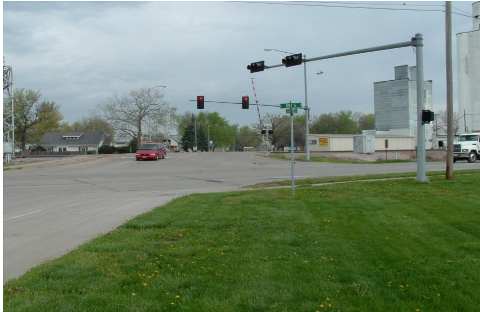
Figure 3.1 N 141 st St. HRGC in Waverly, Nebraska

Data for this research was primarily collected at the N 141 st St. crossing in Waverly and the M St. crossing in Fremont, Nebraska (fig. 3.1 and fig. 3.2, respectively). The Waverly crossing has four sets of railroad tracks, two highway lanes, and is equipped with dual-quadrant gates. The Fremont crossing has two sets of railroad tracks, two highway lanes, and is also equipped with dual-quadrant gates.