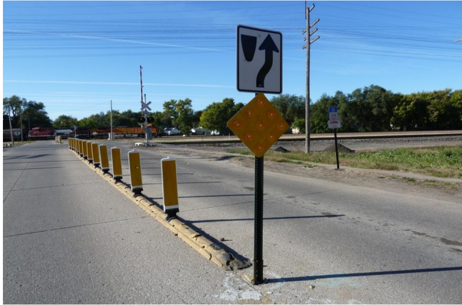
Figure 3.12 Barrier Condition after Maintenance in 2011