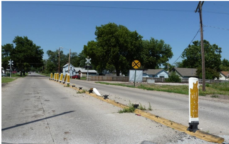
Figure 3.6 Dilapidated Condition of Barrier at Fremont due to Lack of Maintenance