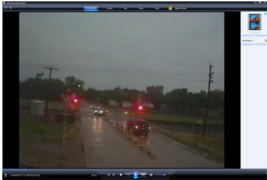
Figure 3.10 Vehicle Passing Around Fully Lowered Gates (Violation Type 2)