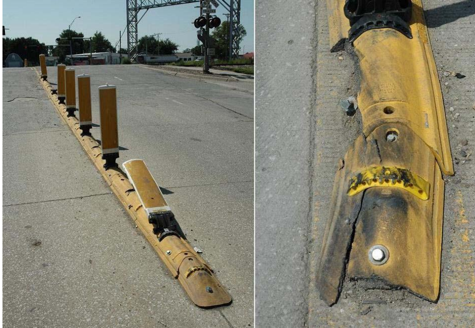
Figure 3.5 Dilapidated Condition of Barrier at the Waverly HRGC