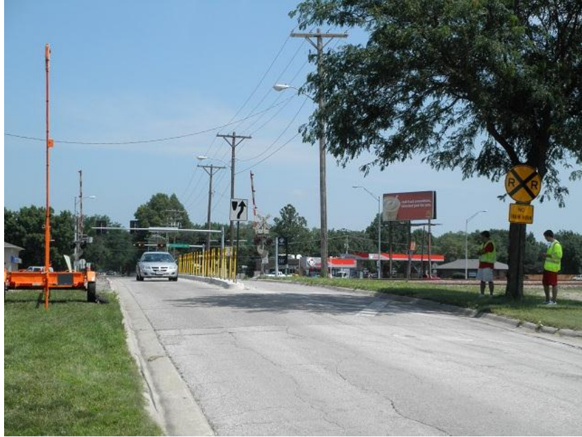
Figure 3.13 Data Collection Setup at the 44 th St. Crossing in Lincoln, NE