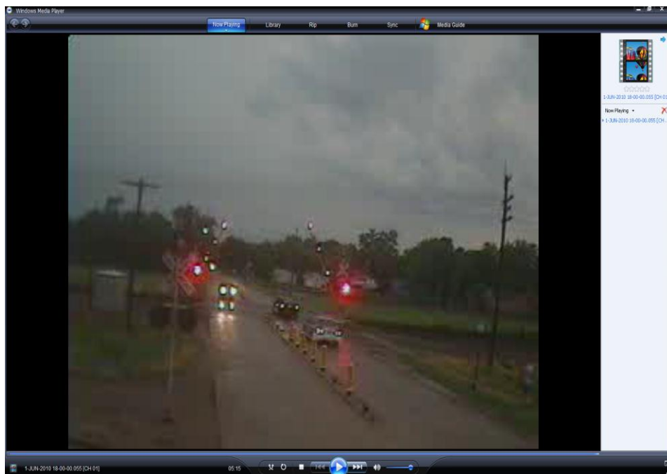
Figure 3.11 Vehicles Passing Under Ascending Gates (Violation Type 3)