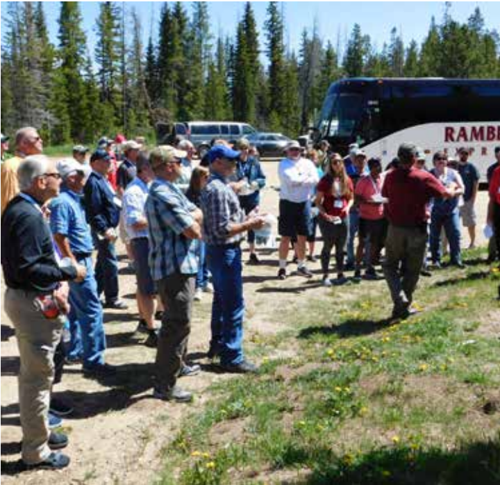
Effects of the Pine Wilt Beetle at the Rocky Mountain Research Station, USDA Fraser Experiment Forest, near Fraser, Colo.