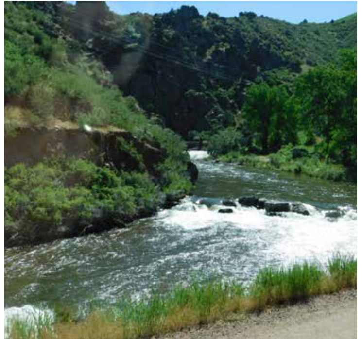
The South Platte River, looking a bit different than it does in Nebraska.