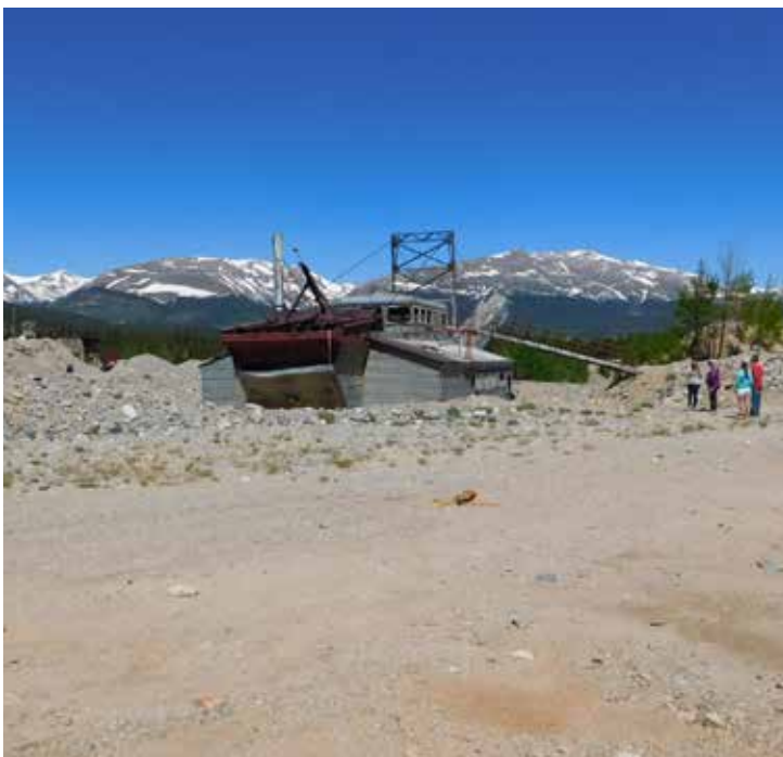
Though 75 years old and one of the few of its kind still existing, the Snowstorm Placer gold dredge, near Fairplay, Colo., only operated for a total of 16 months, helping extract 12,400 ounces of gold.