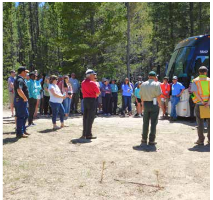
Tour group learns about a dredge mining reclamation site adjacent to the Swan River.