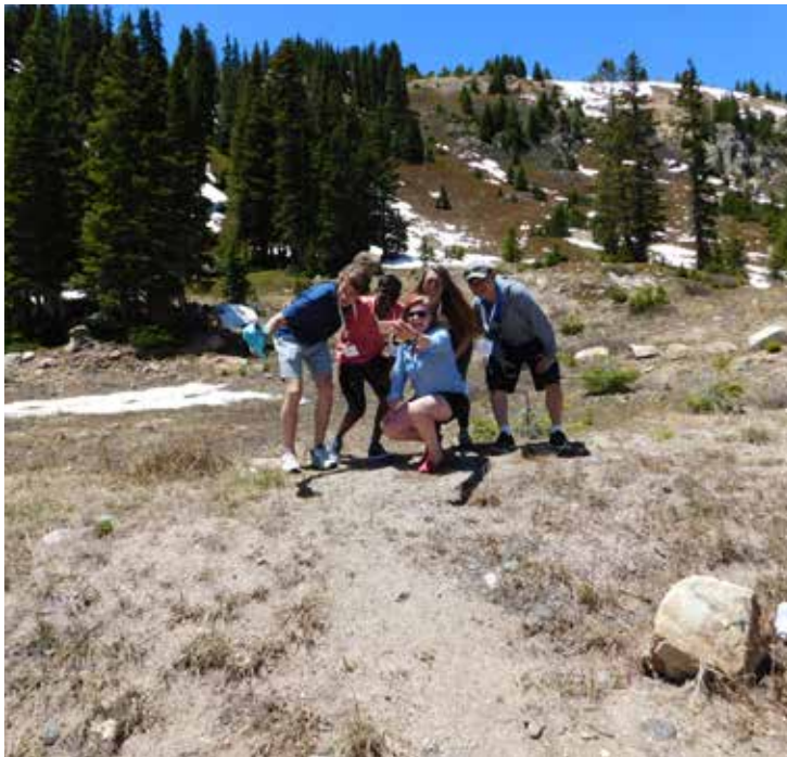
Always time for a high-country selfie.