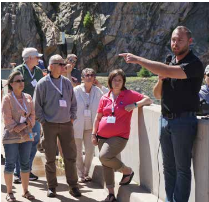
Discussions on Denver water supply on the Strontia Springs Dam spillway.