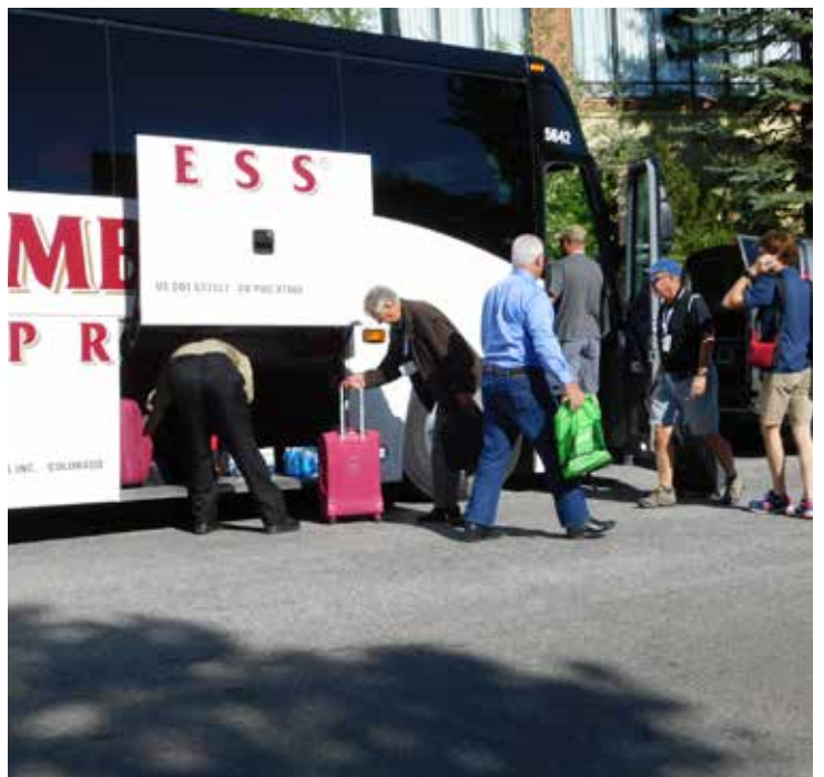
A morning ritual: Getting bags, and people, on the tour bus.