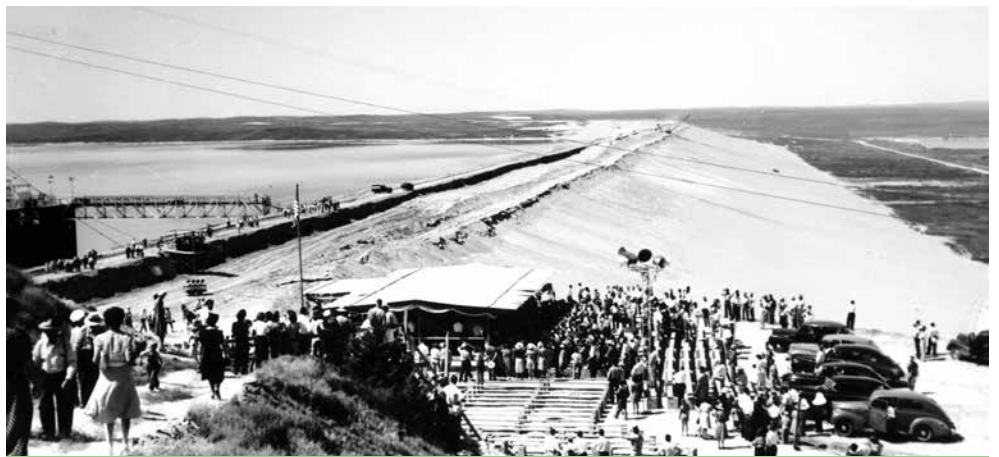
Crowds gather near the south end of Kingsley Dam on July 22, 1941 for the dam's dedication. The dam was closed and storage of water had begun, but work was still unfinished at dedication time, including work on Highway 61, which would run across the crest of the dam.