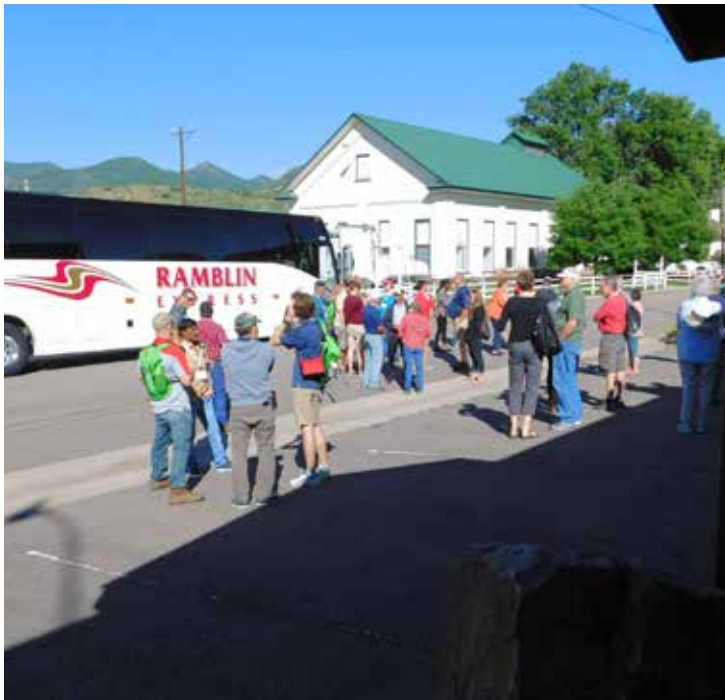
First stop on the tour: Denver Water Board facilities.