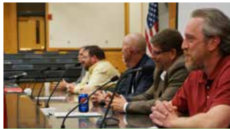
Panel discussions will be an important part of this year’s Nebraska water symposium in October.

“The current state of water planning and management in each basin will be front-and-center in the discussions, along with