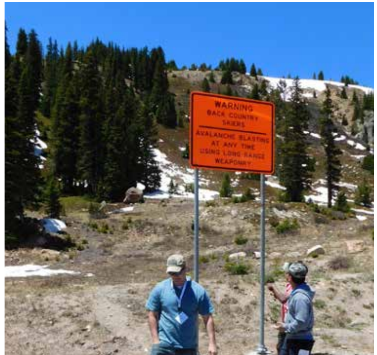
Signs in Colorado aren't always what you see in Nebraska.