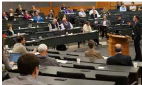
This year’s water symposium and water law conference will be held at Nebraska Innovation Campus on Oct. 20 and 21.

unique and shared problem areas,” Ray said.