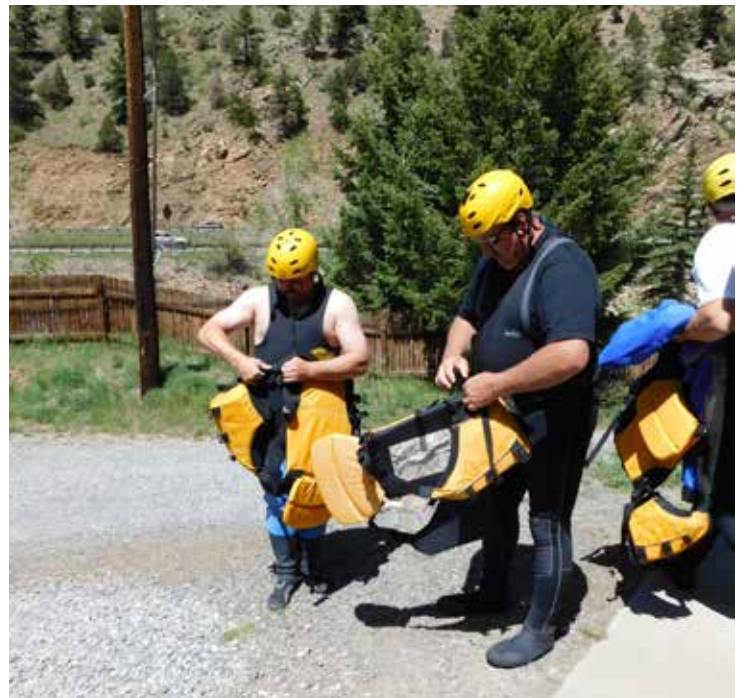
Ready for rafting Clear Creek, complete with helmets and wet suits.