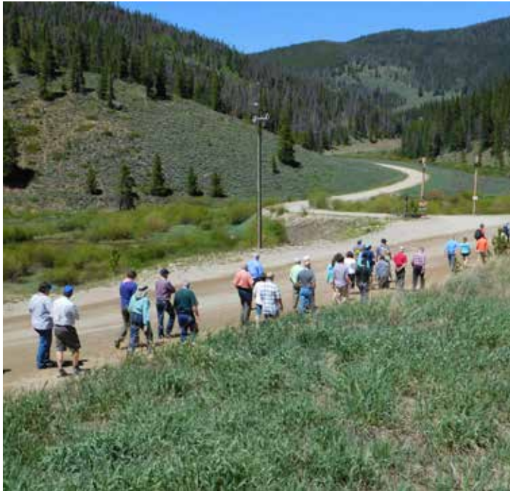
The tour group hikes off to a reclamation site in the beautiful Rocky Mountains.