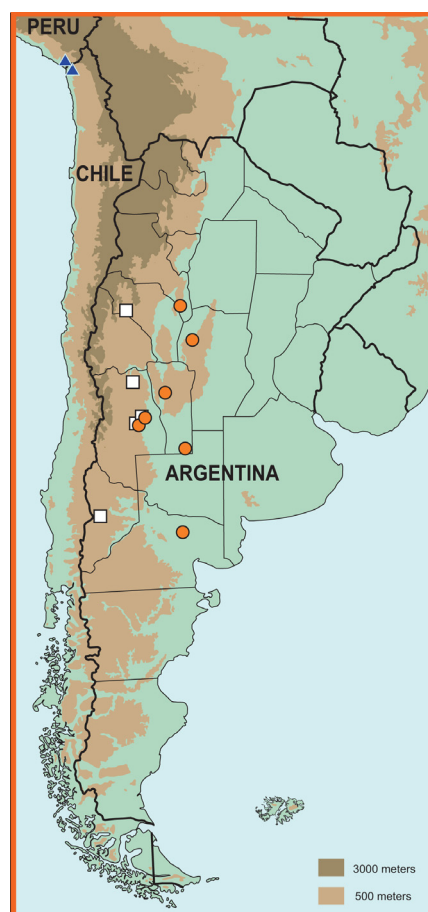
FIGURE 10. Distribution of South American species of the Glaresis inducta group: orange circles = G. fritzi , white squares = G. smithi , blue triangles = G. mondacai .