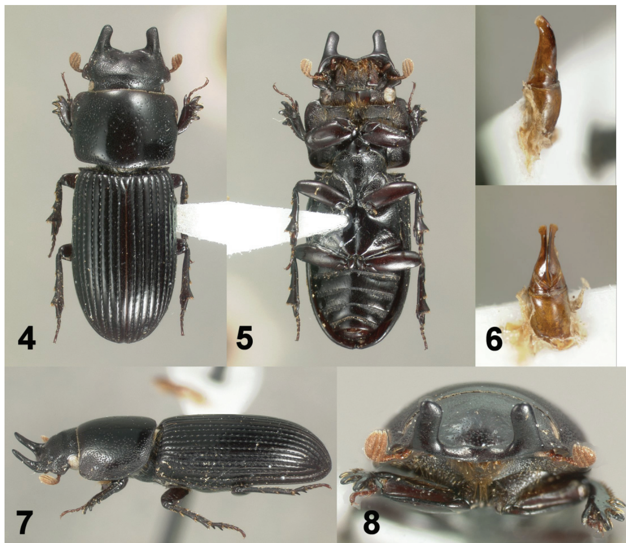
Figures 4–8. Saprovisca sarangay , holotype, male major. 4) Dorsal habitus. 5) Ventral habitus. 6) Genitalia, lateral and dorsal. 7) Lateral habitus. 8) Head, anterior view.

Remarks. The paratype male from South Luzon is similar to specimens from Mindanao, possessing similar diagnostic characters and all other characters studied. It is the smallest specimen studied and its horn development is intermediate between the major and minor males described.