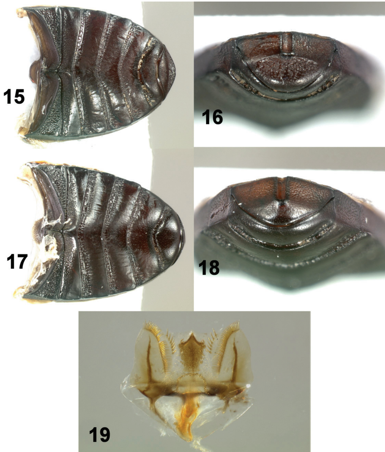
Figures 15–19. Saprovisca sarangay . 15–16) Abdominal sternites and pygidium, male paratype. 17–18) Abdominal sternites and pygidium, female allotype. 19) Epipharynx, male major paratype.