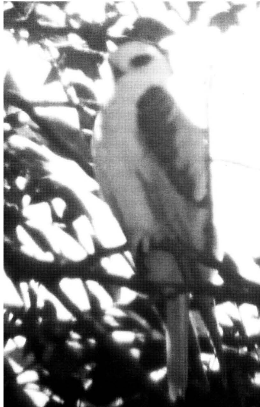
This White-tailed Kite was photographed by Paul Dunbar 29 Jun 2009 in southeast Lincoln Co; it was Nebraska's 6th record and likely the same bird as the 5th record seen there in 2008.