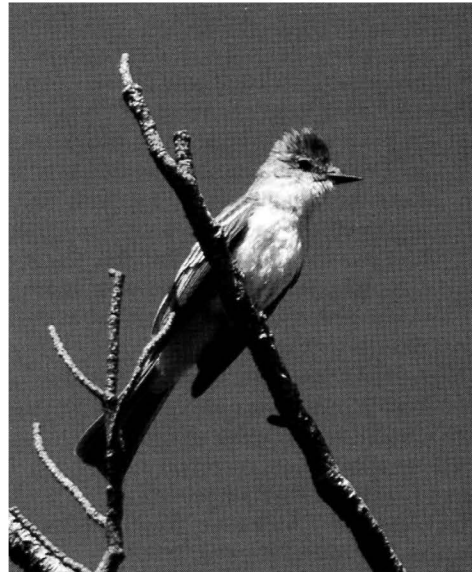
This Ash-throated Flycatcher was present this summer at a 2007 breeding site in Kimball Co.