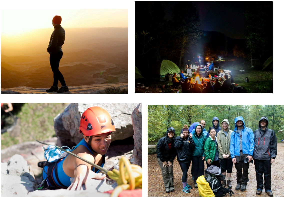
Example of Image Grouping (Figure 1)

This survey was electronically sent out to UNL students, faculty, staff, and alumni using Blackboard's feature to email class members and also through specific college weekly newsletters. The survey link was also posted on social media