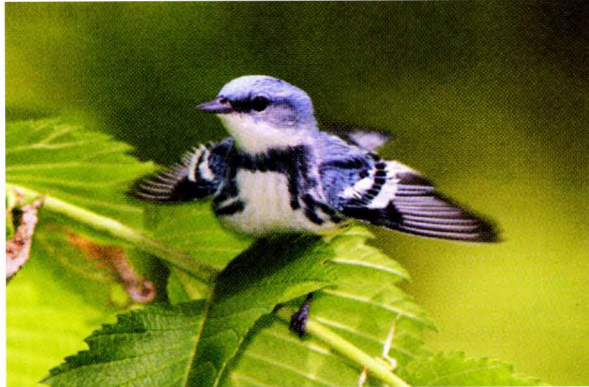
Cerulean Warbler, Hummel Park, Douglas Co., 21 May 2005.