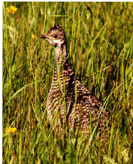
Greater Prairie-Chicken, west of Wood Lake, Cherry Co., 15 June 2007.