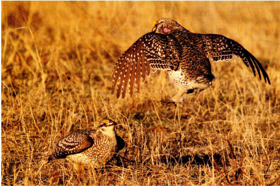
Sharp-tailed Grouse, near Mullen, Hooker Co., 14 April 2006.