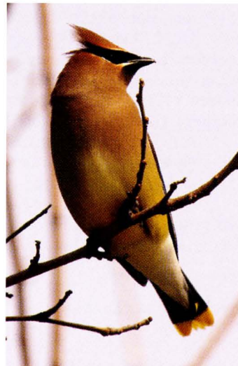
Cedar Waxwing, Fontenelle Forest, Sarpy Co., 5 May 2009.