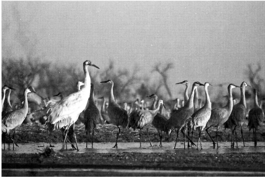
Juvenile Whooping Crane with Sandhill Cranes on the Platte River in Hall Co. in March 2009.

Thayer's Gull: A regular fall migrant, reports were of a basic-plumaged adult in Phelps Co 1-8 Dec (PD) and one at LM 3 Jan (fide SJD). Generally less common as a spring migrant, a first-year bird was at BOL rather early on 14 Feb (JGJ); another or the same was there 25 Feb (JGJ).