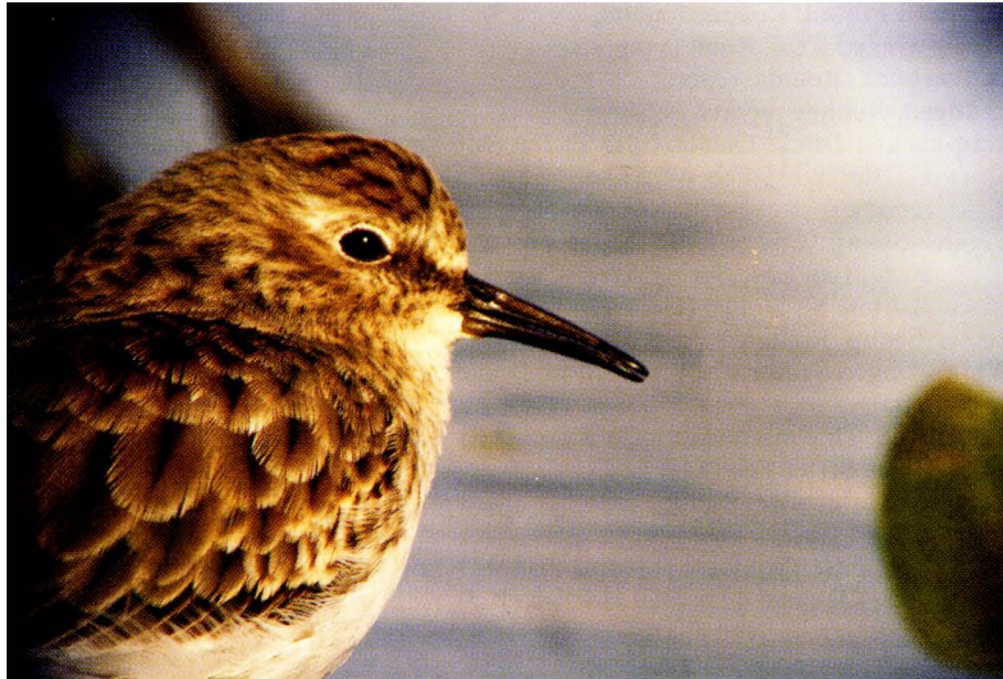
Least Sandpiper in basic plumage, Ayr Lake, Adams Co., 20 Oct 2008.