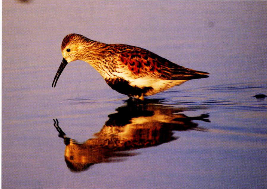
Dunlin, North Lake Basin WMA, Seward Co., 12 May 2008.