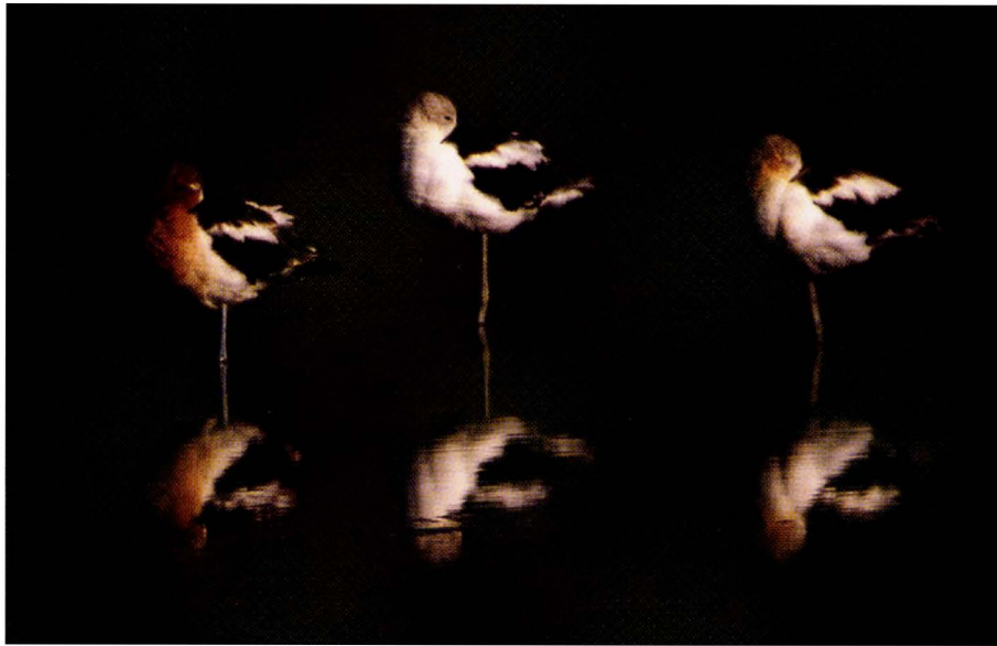
American Avocets, near Lakeside, Sheridan Co., 20 Aug 2006.