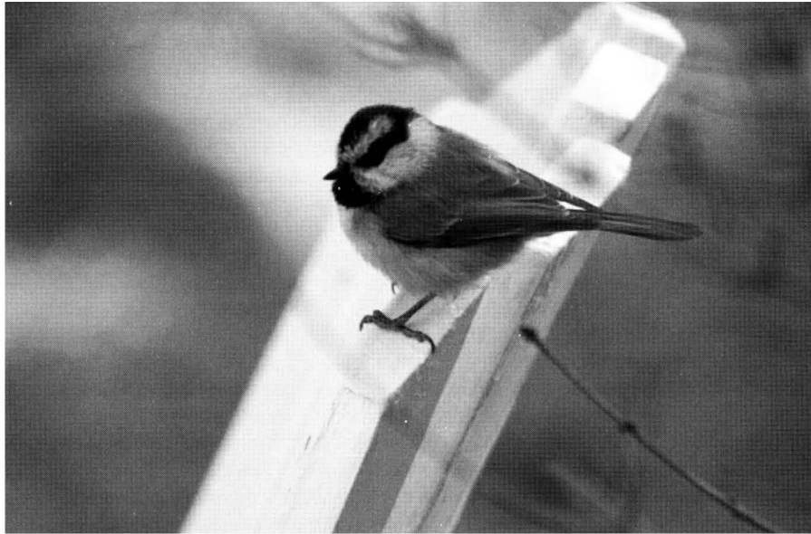
Mountain Chickadee in Scotts Bluff Co., 21 Feb 2009.

Pygmy Nuthatch: The 17 on the Harrison CBC 28 Dec (fide B&DW) was about average for that location.