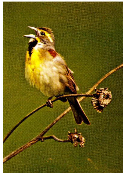
Dickcissel, Audubon Spring Creek Prairie, Lancaster Co., 16 June 2009.