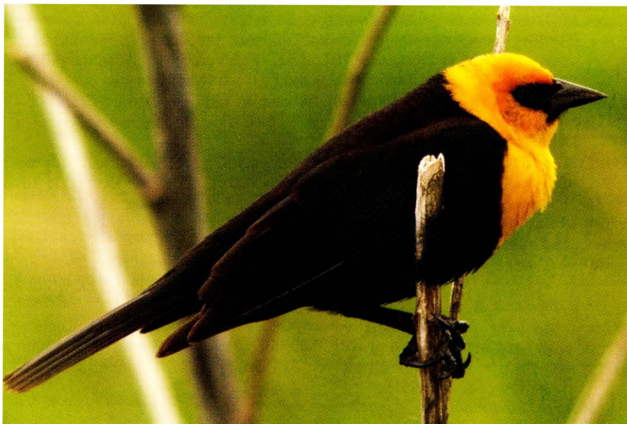
Yellow-headed Blackbird, Harvard WPA, Clay Co., 28 May 2007.