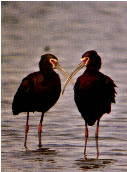
White-faced Ibis, Harvard WPA, Clay Co., 22 April 2006.