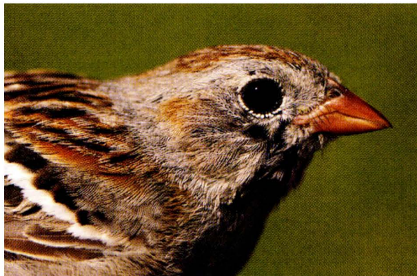
Field Sparrow, Audubon Spring Creek Prairie, Lancaster Co., May 2008.