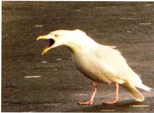
Adult Glaucous Gull, Lake Ogallala, Keith Co., 2 Jan 2009.