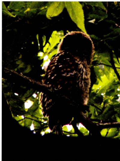
Barred Owl, Walnut Grove Park, Douglas Co., 5 June 2009.