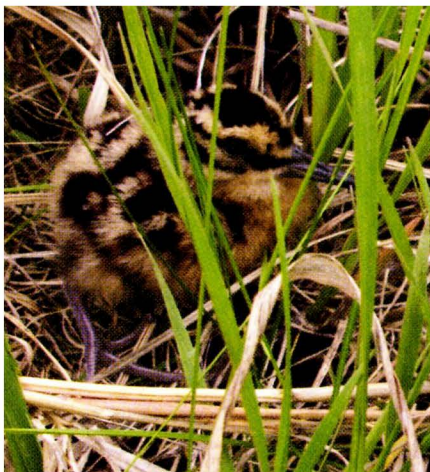
American Woodcock chick, Oak Glen WMA, Seward Co., 11 May 2009.