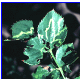
Figure 1. Wavy line pattern of rose mosaic.

Roses are affected by two types of mosaic diseases, rose common mosaic and rose yellow mosaic. The mosaic diseases are the most common virus diseases of roses. The rose mosaic virus is transmitted to healthy plants by budding or grafting virus-infected plant material to healthy plant material. Each year the major rose companies spend thousands of dollars to control the spread of rose mosaic and other virus diseases.