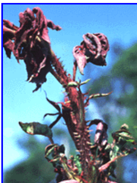
Figure 4. Stunted deformed canes caused by rose rosette.

Rose rosette occurs as a natural infection on wild rose species. This disease, thought to be caused by a mite-transmitted virus, is endemic to the Midwest where Rosa multiflora hedges are frequently planted and become infected. The disease occurs sporadically in the United States on cultivated roses.