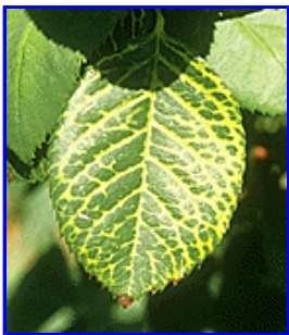
Figure 3. Vein-clearing pattern of rose yellow mosaic.

Control of rose common mosaic and rose yellow mosaic rests solely with the commercial rose grower to provide virus-free understocks and virus-free budding and grafting material. Most commercial rose growers obtain virus-free propagating material through a program of thermotherapy (heat treatment) and virus indexing. For example, buds taken from plants held at 100 degree Fahrenheit for four weeks are usually free of rose mosaic viruses.