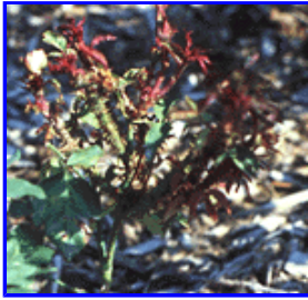
Figure 5. Witches' broom symptom of rose rosette (34K JPG).

An early indication of infection by rose rosette virus is rapid stem elongation. Later, certain canes become thickened and excessively thorny ( Figure 4 ). Infected canes produce many short deformed shoots, giving the appearance of a witches' broom ( Figure 5 ). Leaves are deformed, wrinkled, and pigmented a bright red. Blossoms often are aborted, deformed, or converted to leaf-like tissue. Unlike the mosaic diseases, rose rosette is fatal to infected plants. An infected rose usually dies within two years as symptoms spread throughout the plant.